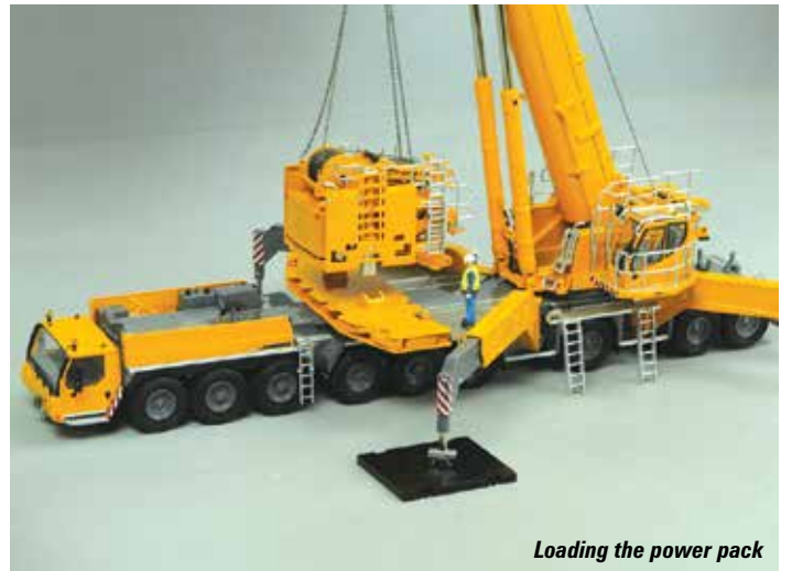
Loading the power pack