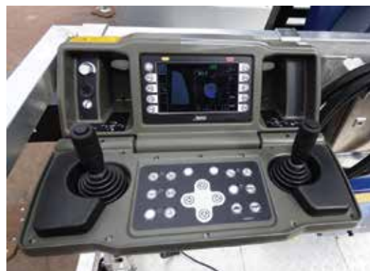
The control panel on the Bronto S35EM.

An integrated secondary guarding system automatically protects the operator from overhead crushing incidents.