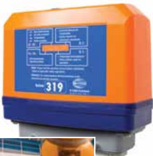
The FSE 319 plug and play receiver

The Harting Han or ILME connectors can be plugged directly into the machine controls without additional wiring. The FSE 319 also features an integrated flashlight/torch and horn and HBC's automatic frequency management with adaptive frequency hopping. Suggested combinations with HBC transmitters include the micron 5, which is widely used in crane applications.