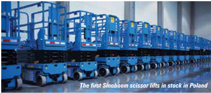
The first Sinoboom scissor lifts in stock in Poland