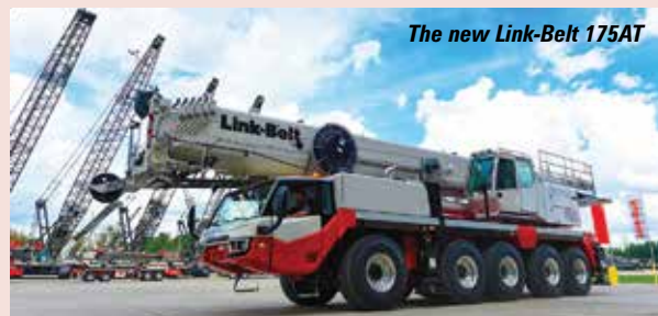
The new Link-Belt 175AT

Link Belt has also unveiled a new European-style 150 tonne five axle All Terrain crane, the 175AT with a 60 metre pinned boom, plus 16.8 metre bi-fold swingaway extension. The drive train is Cummins Tier 4 Final diesel, matched to a ZF TraXon transmission with 10x8x10 four axle drive and all wheel steer. More on this model in next month's issue.