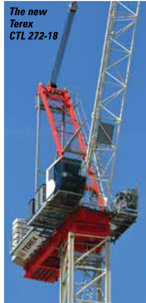
The new Terex CTL 272-18

The CTL 272-18 is pre-configured for the installation and set up of zoning and anti-collision systems and cameras. It is also compatible with the next generation of Terex tower crane telematics.