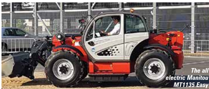
The all electric Manitou MT1135 Easy