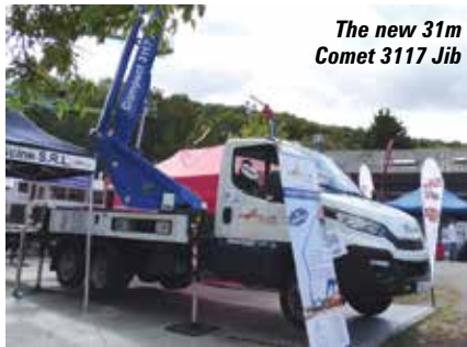
The new 31m Comet 3117 Jib

Although it is not obvious, the platform is mounted on a trailer behind the 3.5 tonne truck chassis. Weighing 6,850kg it offers 17 metres of outreach with a 250kg platform capacity through 360 degrees and a bi-energy power pack. See the Small truck mounts page 29 for more information.