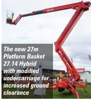
The new 27m Platform Basket 27.14 Hybrid with modified undercarriage for increased ground clearance