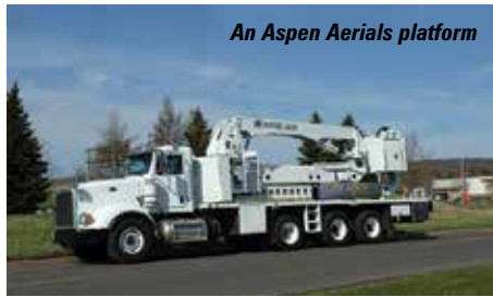
An Aspen Aerials platform

Time Versalift has made three new acquisitions in the USA, including underbridge inspection platform manufacturer Aspen Aerials and two Versalift dealers - Knoxville, Tennessee based O.G. Hughes & Sons, and MAP Enterprises of Graham, South Carolina which also handles Hiab loader cranes. Aspen Aerials was established 30 years ago and is based in Duluth, Minnesota where it manufactures a range of six underbridge inspection platforms. It will continue to operate as an independent entity under Time Manufacturing ownership. O.G. Hughes and MAP Enterprises will merge their three locations in Tennessee, Georgia and South Carolina into Versalift Southeast - a newly established, wholly-owned distributor.