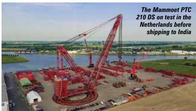
The Mammoet PTC 210 DS on test in the Netherlands before shipping to India

No details of the upgrade have been disclosed but it has been developed to handle a 2,000 tonne module at the world's largest refinery in Jamnagar, India, owned and operated by Reliance which has awarded Mammoet the contract for critical heavy lift work. The PTC 210 DS can handle 2,000 tonnes at up to 78 metres radius, with 3,500 tonnes of ballast and 117 metre boom or 58 metres radius on a 140 metre boom.