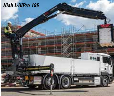
Hiab L-HiPro 195

Hiab has launched three new 'building material' cranes - the L-HiPro 145, L-HiPro 195 and L-HiPro 235 - which range from 13 to 20 metre/tonnes. They are equipped with Hiab's top end control systems, including its innovative Crane Tip Control (CTC), which allows even novice operators to perform complicated movements to deliver the load simply and safely, the Load Stability System which automatically compensates for unintentionally excessive lever operation, high speed boom extension and optional HiPro remote control system.