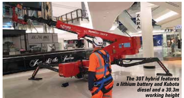
The 30T hybrid features a lithium battery and Kubota diesel and a 30.3m working height

The lift has an overall stowed width of 890mm and an overall height of 1.96 metres, while overall length is 6.52 metres. For extra stability when travelling the tracks can be extended to a width of 1.29 metres. Given its performance the 30T is also relatively lightweight at 4,250kg. It was purchased through the manufacturer's UK dealer Promax Access.