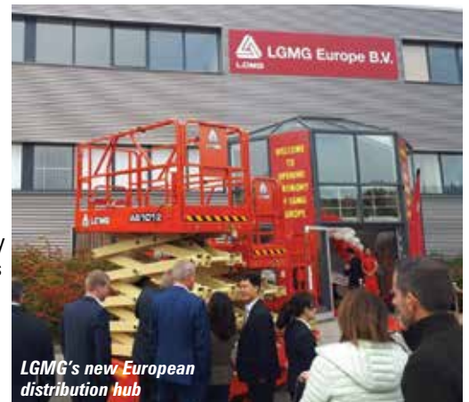
LGMG's new European distribution hub

Established in 1972 as a general construction equipment manufacturer LGMG only began manufacturing aerial work platforms in 2015. Its product line currently includes scissor lifts ranging from 12 to 46ft and boom lifts from 39 to 78ft. The company will initially focus on scissor lifts in Europe but aims to add boom lifts next year.