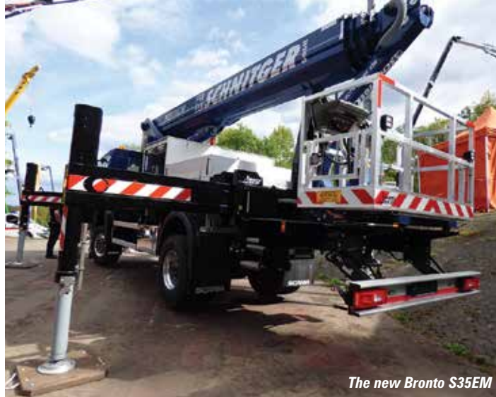
The new Bronto S35EM