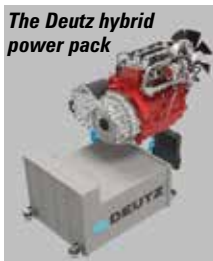
The Deutz hybrid power pack

The first battery electric telehandler - an 11 metre/3,500kg MT 1135 - is equipped with a 360 volt power supply with a 30 kWh battery feeding a 60 kW electric motor. The MT 1135 is normally equipped with a Deutz TCD 3.6 diesel however on the hybrid prototype this is replaced by a Deutz TCD 2.2 diesel plus a 20 kW electric motor and 48 volt electrical electric system.