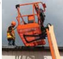
The system allows the operator to work outside of the platform

The system meets both ANSI A92.5 and CSA B354.4-02 North American standards and can be installed to any 6ft or 8ft JLG platform. It can easily be transferred from one platform to another, doesn't require a specially reinforced platform and doesn't affect platform capacity.