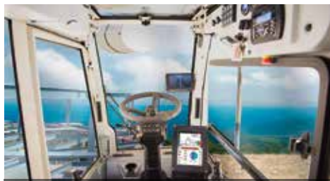
The Link-Belt 100RT also features an updated cab

The cab is an update of Link-Belt's latest design with up to 20 degrees of tilt and features Link-Belt Pulse 2.0 load moment and information system with a 10 inch screen and WiFi connection for remote software updates. The system incorporates V-Calc set-up allowing variable outrigger set-up and automatic monitoring. Shipments of the new crane are due to begin during the first quarter of next year.