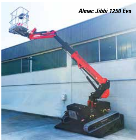
Almac Jibbi 1250 Evo

Equipped with a three cylinder Yanmar diesel, the lift is 1.15 metres wide, 1.98 metres high, 3.7 metres long and weighs 2,850kg. The unit is equipped with 'Dynamic Working Performance' which constantly adjusts the machine's performance to match working conditions and a new patented rubber track system - Safe-Lock - said to prevent the track from coming off its tensioning wheels. An ultrasonic secondary guarding system is also part of the package and a 250kg winch kit as available as an option. Deliveries will start from March 2019.