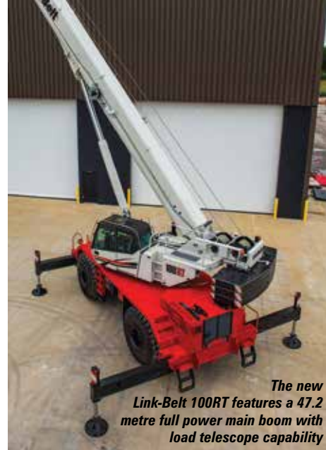
The new Link-Belt 100RT features a 47.2 metre full power main boom with load telescope capability

Stop Press • Stop Press • Stop Press • Stop Press