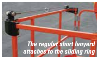
The regular short lanyard attaches to the sliding ring

JLG has launched an External Bolt On Fall Arrest system, which allows the occupant of a boom lift to exit the platform at height while remaining tied off to a lanyard anchor point on the platform. The simple system consists of two steel brackets connected by a 1.8 metre cable with a sliding ring to which a lanyard hook connector can be attached. The company says that attaching the lanyard to the ring gives the operator more room to move around and perform tasks outside of the platform.