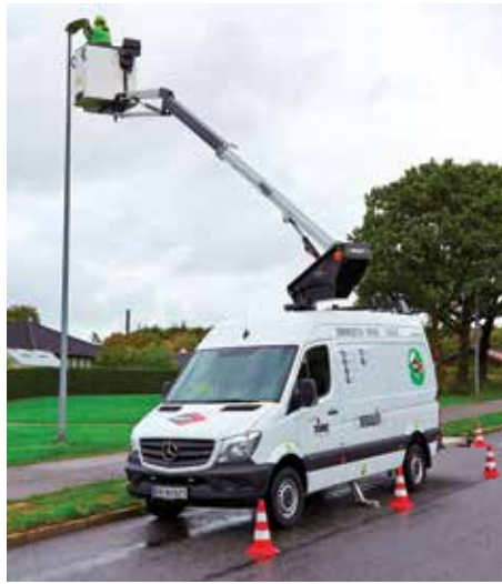
The new Versalift VTL-145-F

The chassis retains its standard diesel power train, while the platform can be operated via the vehicle's PTO pump, or via an electric motor with separate hydraulic pump and an onboard lithium ion battery pack which is said to be sufficient for a full day's work with the vehicle's engine turned off. The battery can be topped up while travelling between jobs.