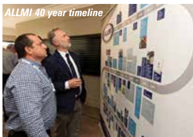
ALLMI 40 year timeline