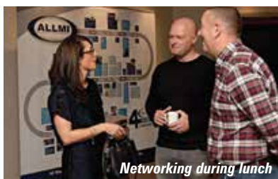
Networking during lunch