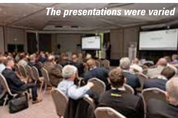
The presentations were varied