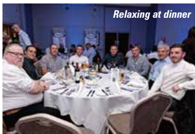
Relaxing at dinner