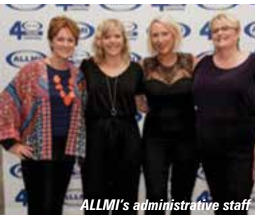
ALLMI's administrative staff