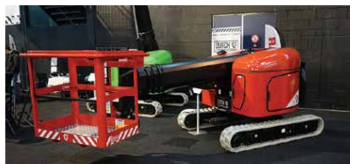
New entrant 'Dutch Crane Factory' showed its new range of tracked booms with working heights of up to 14 metres

The organisers said that 1,600 visitors attended the second of the three day show to see 40 exhibitors, representing the majority of aerial lift manufacturers. The exhibits included a surprising number of new product launches including crawler booms from Custers and the Dutch Crane Factory and the launch of the new scissor and vertical mast lifts from China's EHM - Eastman Heavy Machinery by Fontexx Cranes and Access which has an exclusive distribution deal for Europe excluding France and Turkey. Full report page 50.