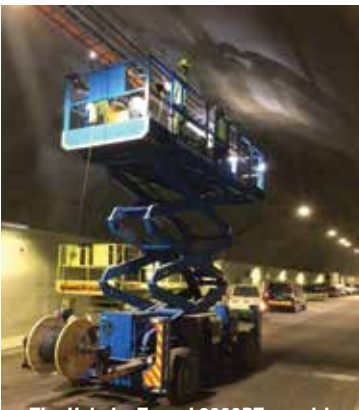
The Hybeko Tunnel 3390RT can drive on inclines of up to eight degrees at working heights of up to eight metres

Hybeko decided to retain the diesel power rather than convert to battery power due to long recharging times and the fact that recharging is not permitted in tunnels in Norway. The engine is equipped with a high performance catalyst and diesel particulate filter to keep emissions as low as possible. The Tunnel GS-3390 features the 7.39 metre long dual extension Super Deck, a chassis mounted cable drum stand that extends to avoid interference with the extended deck, towing support and air/water services to the platform.