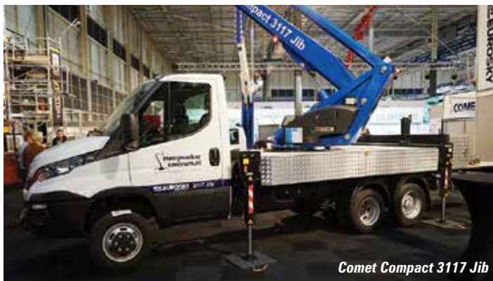
Comet Compact 3117 Jib