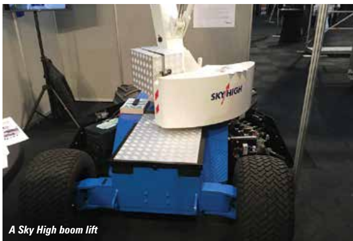
A Sky High boom lift