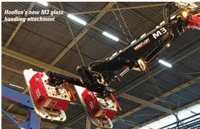
Hoeflon's new M3 glass handling attachment