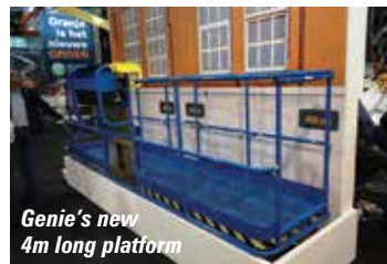
Genie's new 4m long platform