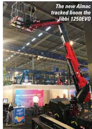
The new Almac tracked boom the Jibbi 1250EVO