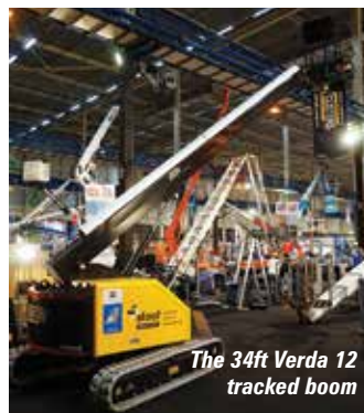
The 34ft Verda 12 tracked boom

vertical mast lifts. The nine model electric scissor range includes 19, 20, 26, 32, 40 and 46ft slab electric machines, powered by gel or lithium ion batteries. Its mast type vertical self-propelled lifts include the all-electric E-Series and hydraulic lift M series, each comprising two models the 8ft E8 and M8 and the 12ft E12/ M12. The company is also planning a 16ft E16/M16.