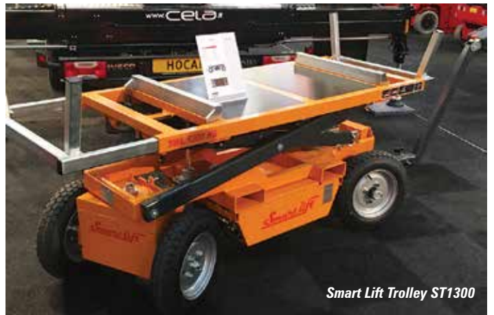
Smart Lift Trolley ST1300