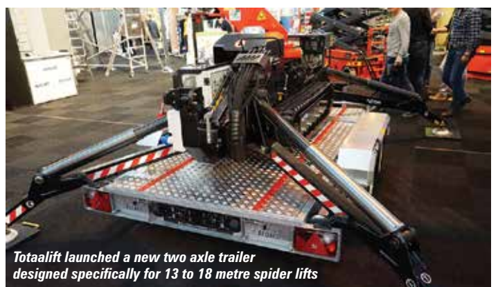
Totaalift launched a new two axle trailer designed specifically for 13 to 18 metre spider lifts