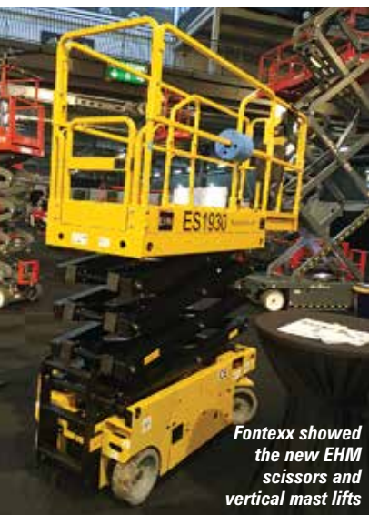
Fontexx showed the new EHM scissors and vertical mast lifts

Custers launched the Verda 12 34ft tracked boom with 12.3 metre working height and 10.3 metres outreach. A lighter version weighing