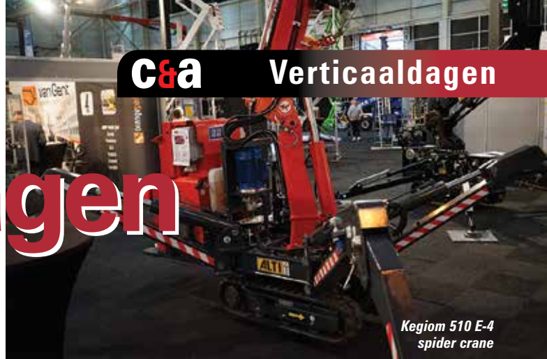
Kegiom 510 E-4 spider crane

The show saw the debut of the new Fontexx Cranes & Access/ EHM - Eastman Heavy Machinery - master distribution partnership. The two have agreed an exclusive deal for Europe - outside of France and Turkey - for EHM scissors and