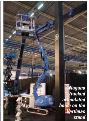
Nagano tracked articulated boom on the Vertimac stand