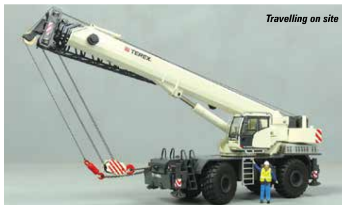
Travelling on site