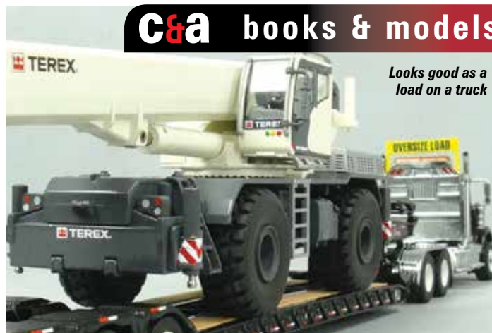
Looks good as a load on a truck