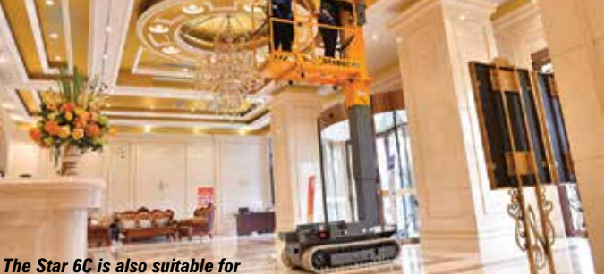
indoor applications where low ground bearing pressures are required