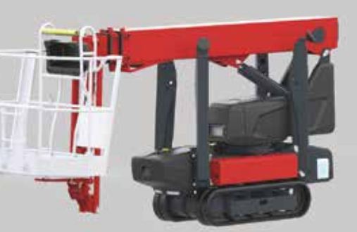
A rendering of the new Hinowa TC13 spider lift

The TC13 lift has an overall length with basket removed of just under 3.7 metres, an overall width of 748mm and an overall height of 1.95 metres. The extended outrigger footprint is 2.45 by 2.9 metres - the width of a single parking space. Other features include automatic control of telescopic and elevate functions so that it can lift or lower parallel to the work to a height of nine metres, as well as 'go home'/'go back' functions to stow the machine or return to the last working position with the press of a single button.