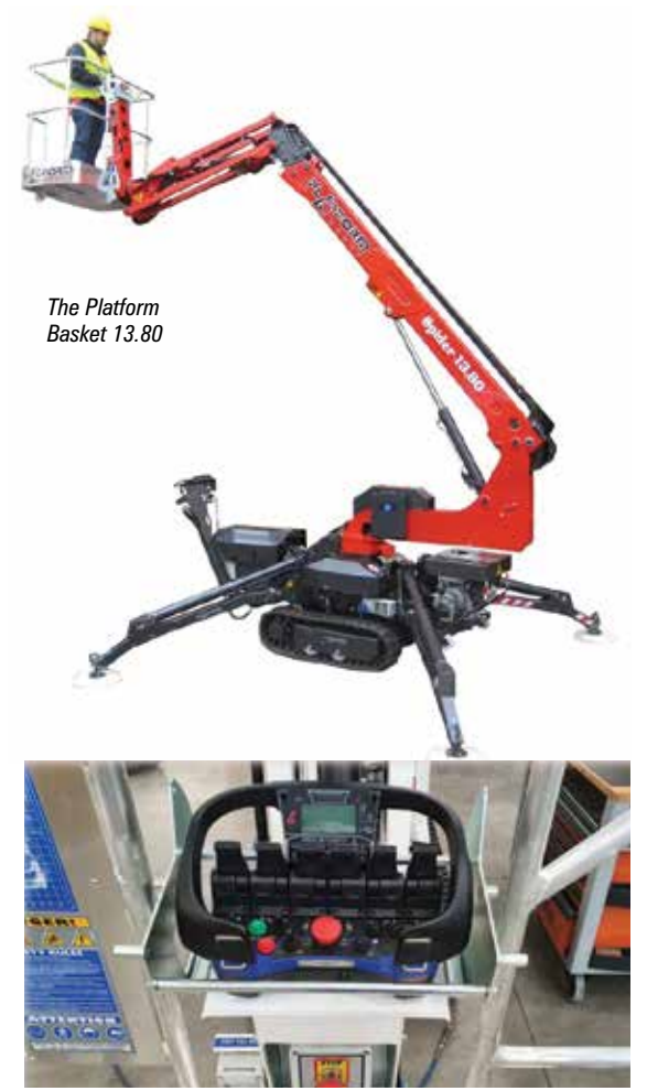
The new Scanreco remote controller in the basket cradle.

Once the machine is set up and levelled, the remote controller sits in a cradle in the basket and in the case of any battery issues it can be plugged into a spare connector below the cradle to create a tethered controller. The Pro package is only available on a new machine and cannot be retrofitted. Shipments are due to begin in July.