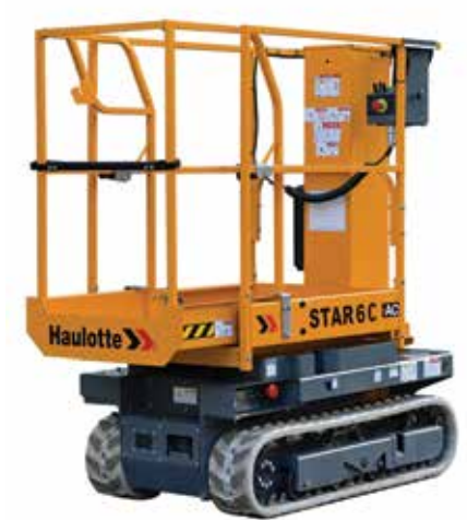
Haulotte's new tracked Star 6 mast type lift

With significantly lower ground bearing pressures than a wheeled platform of this type, the Star 6C is as suitable for working on sensitive flooring such as marble tiles as it is for soft or rough terrain. Dual