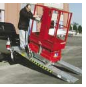
The Bravi range of self propelled masts offer remarkable gradeabilitiy

This can be useful if a kerb, or other obstacle prevents the placement of the machines base directly under the work.