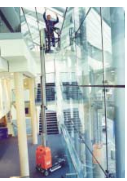
Atrium cleaning and maintenance are perfect applications for self propelled versions of the push around.

A year ago JLG acquired the Manlift PM range, built in France, It now identifies this range as "Personnel Manlift" The product line has six models, and is unusual in that it achieves the tallest heights by stacking up more mast sections, rather than using longer ones. The benefits of such an approach is that even the 12 metre model closes up to a stowed height of 1.98 metres. A tilt back