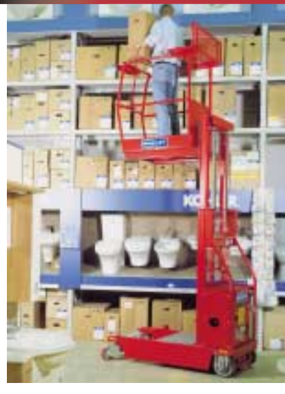
The self propelled mast lifts are ideal for stockpicking.

The principal appeal of this type of lift is the low entry level height, you step in rather than climb in, the low overall height, which allows users to