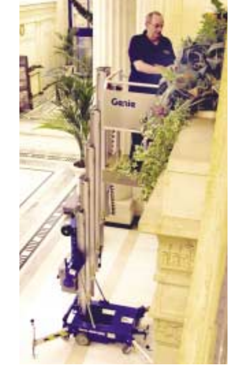
Retail applications are ideally suited to vertical mast lifts.

This can be useful if a kerb, or other obstacle prevents the placement of the machines base directly under the work.