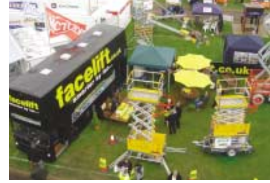
Facelift and its new bus