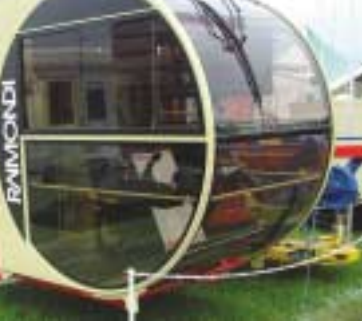
The new Ravan/Raymondi tower crane cab on the Vanson crane stand