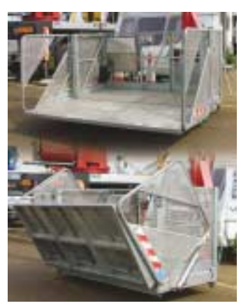
The roofers platform option on the Oil&Steel 35m Eagle truck mount.