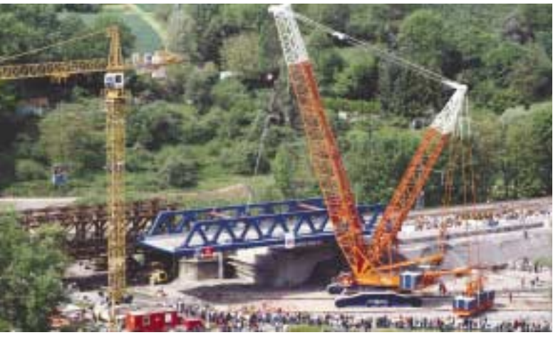
The Liebherr LR750 travels off centre with its 325 tonne load avoiding a tower crane.

The crane covered the distance without any hitches. A tower crane located next to the road required the crane to travel the last part of