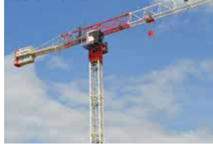
Terex CTT 202-10

show the all-new CTT 202-10 flat top tower crane, alongside its new tower crane elevator that can be used both internally within the tower sections or externally. Also check out its new T-Link tower crane telematics system. Rough Terrains will be represented by an upgraded RT90 together with details of future models. Other All Terrain cranes on the stand will include the three axle AC45 City, AC55-3, AC100-4, AC220-5 and AC300-6 with luffing jib.