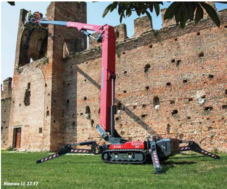
Hinowa LL 33.17