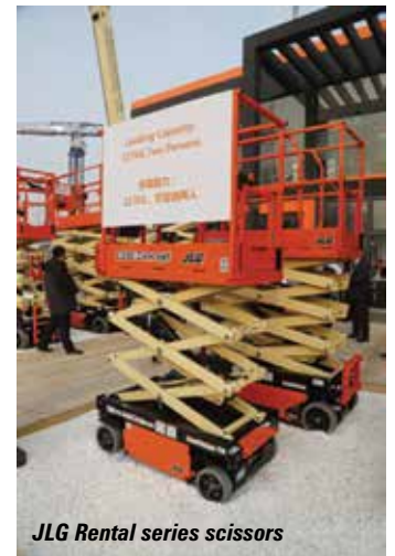
JLG Rental series scissors

functions on its scissor lifts, for safer loading/unloading etc... Look out for more coverage in our second preview in the March issue.