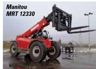
Manitou MRT 12330

Manitou has also been working closely with Deutz on the development of an all electric telehandler drive line. It will show two prototypes, the 3.5 tonne/11 metre MT 1135 equipped with a 360 volt battery pack feeding a 60 kW electric motor and the MT 1335 hybrid, normally fitted with a smaller Deutz diesel, combined with an electric motor and 48 volt battery pack.