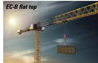
EC-B flat top

A new eight model range of EC-B flat top tower cranes have capacities from six to 16 tonnes and jib tip capacities from 1.6 to 2.8 tonnes at a radius of up to 58 metres. Three of the new tower