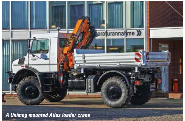
A Unimog mounted Atlas loader crane

The company will also show its latest Rental series slab electric scissor lifts, including the new 1330 micro model show as a concept machine at Bauma China. It offers a 13ft platform height, 760mm overall