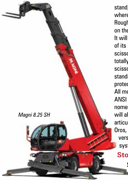
Magni 8.25 SH