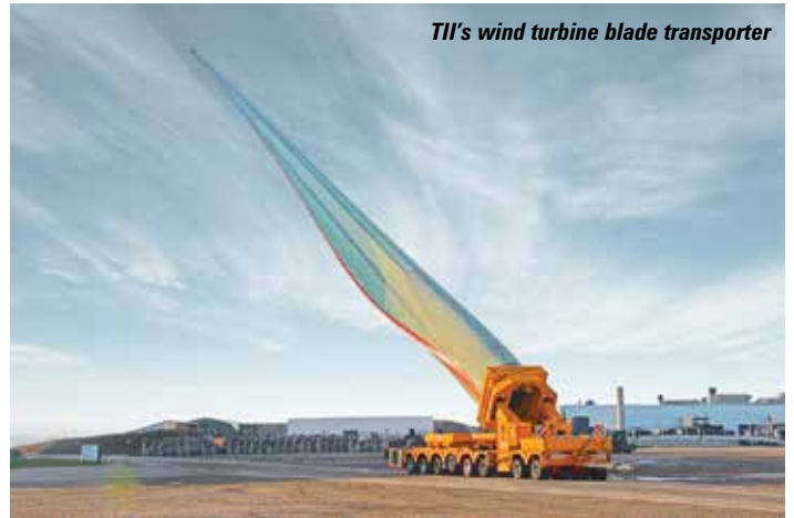
TII's wind turbine blade transporter

width, direct electric drive and an overall weight of under 900kg. Along similar lines are the new 15ft 1530 and 19ft 1930R, along with the new 26ft 780mm wide 2632 and 32ft/1.2 metre wide 3246.