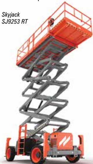
Skyjack SJ9253 RT

stand, and can be found in Hall C4, where it will show a new top end Rough Terrain scissor lift based on the SJ9250 - the 53ft SJ9253. It will also show the first models of its next generation electric slab scissors including the SJ4740 - a totally updated model with new scissor stack - which meets new standards and has improved pothole protection and a new controller. All models are updated to the new ANSI rules and new designs and nomenclature will be adopted. It will also show the SJ46 and SJ51 articulated booms manufactured in Oros, Hungary as well as an updated version of its Elevate telematics system.