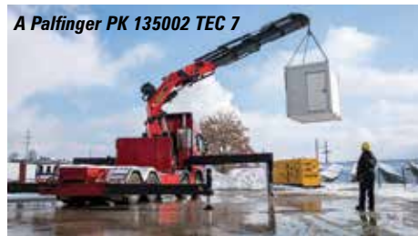
A Palfinger PK 135002 TEC 7

The access stand will feature its first hybrid truck mounted platform - the 37 metre P370 KS E - and a prototype PK 18502 SH electric powered model, two new Light class NX platforms the P220 BK and the P280 CK, and the P130 A and P 200 AXE Smart class platforms together with a 25 metre P 250 AJTK spider lift and an insulated platform with 14 metres outreach.