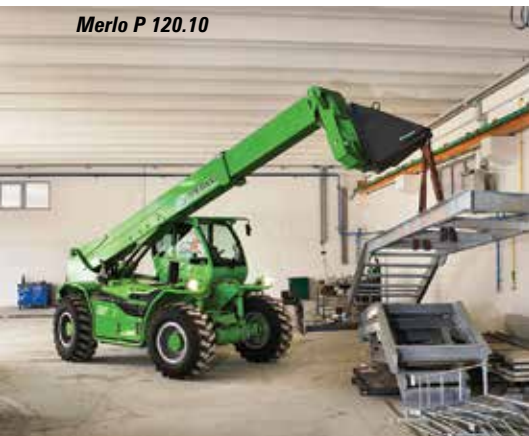
Merlo P 120.10

Merlo will launch eight new telehandlers, including four Panoramic straight frame models all of which are available in two versions with stabilisers or without. They also incorporate all of the new features launched at the last Bauma on its agricultural range. Four new Roto units can be seen including its largest to date the 34.2 metre/4.95 tonne Roto 50.35S-Plus. The new ASCS safety system in the new Roto range analyses data in real time such as load position - boom angle, turret rotation and undercarriage rotation - outrigger position, weight of the load and attachment in use to create a load diagram showing areas of safe/unsafe operation.