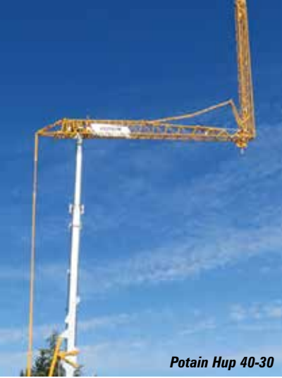
Potain Hup 40-30

three Potain tower cranes including a flattop, a luffer and a new self-erector along with several new technological developments. While details of most of the new launches are being kept secret, the company has confirmed that one of the new products is an upgraded three axle, 60 tonne GMK3060 with longer - 48 metre - seven section pinned boom, improved load charts and a slightly shorter overall length. It will also be available with a choice of Tier 3 or Tier 4 final diesels. Other cranes on show will be the new four axle 90 tonne GMK4090 which was announced at the end of 2017 and an 80 tonne four axle GMK4080-2 - essentially the same crane with less counterweight.