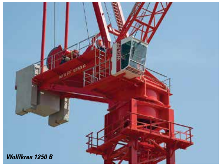
Wolffkran 1250 B

Cummins is celebrating its centenary and will show its latest Stage V diesel developments, which offer more power and fuel efficiency allowing it to replace engines of higher displacement. Also on show will be the Stage V F3.8 power unit