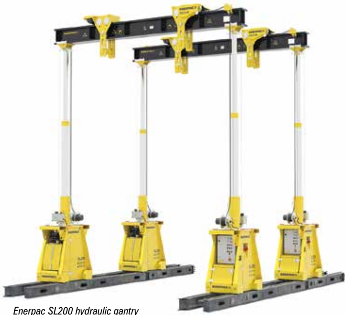
Enerpac SL200 hydraulic gantry

continuous movement compared with skidding systems. It will also show the SCJ50 50T Cube Jack and the new SL200 Super Lift hydraulic gantry, with 200 tonnes capacity, featuring two stage lift cylinders with a maximum lifting height of 6.7 metres.