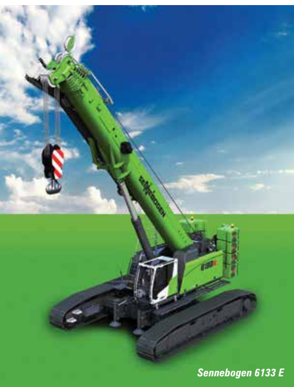
Sennebogen 6133 E

Alimak is also extending its transport platform range - suitable for both passengers and materials - with the addition of the single mast TPL 800, a five person hoist with a lifting height of 100 metres. Lift speed is 12 metres a minute in passenger mode and double that for materials.