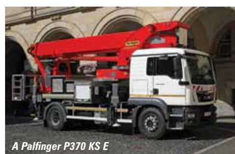
A Palfinger P370 KS E