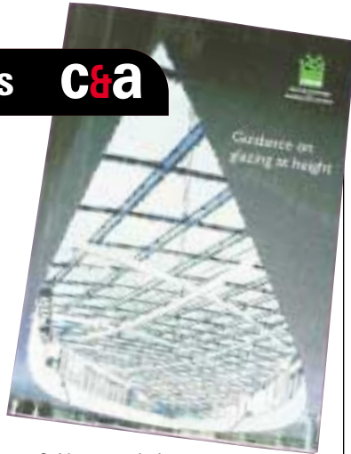
Guidance to glazing at height is a thorough guide to glass but short on lifting and accessing it.

If you are a contractor involved with commercial glazing then this is definitely a book for your office