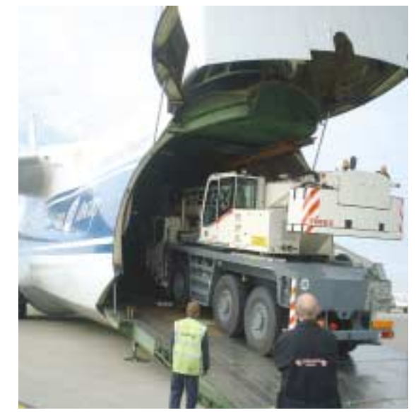
Two 50 tonne Demag AC50-1 were recently sent by air to Kuwait