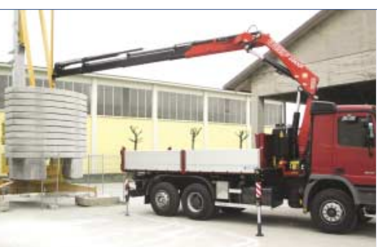
The Fassi F235AXP has won the SED 2005 award for excellence