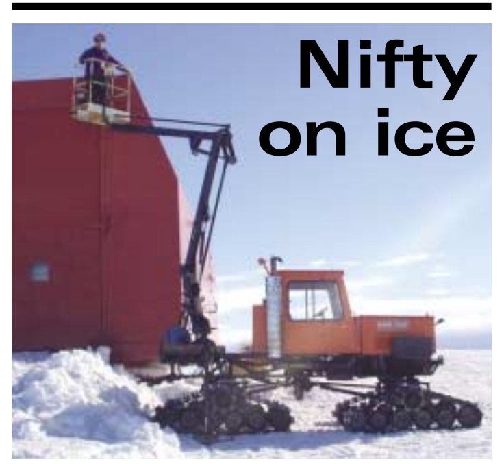
The Nifty 12 mounted to a Sno-cat in Antartica

In 1991 Niftylift supplied the British Antarctic Survey with a 12 metre high working platform to be fitted to a Sno-cat. The unit has been used for all manner of access duties since then, in temperatures as low as minus 30 degrees Celsius.