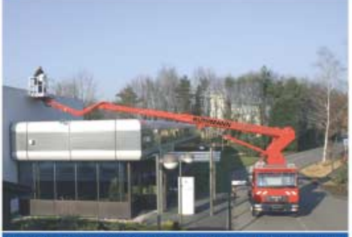
Flexibility and keen operativeness in each respect: variable jacking, short overall length short wheelbase, high case carrying capacity of 329 kps, siting inaccuracy up to 5° . the new RUTHMANN STEIGERS T 270 is really an access platform for all events. No matter whether window cleaning, tree pruning, construction work or maintenance jobs at high spots ... with this STEIGER? you can carry out each job up to a working height of 25.49 m and lateral outreach of 20.40 m respectively.

Readiness for use and functionability also with an inclination of max. 5°, that means considerable minimization of set-up-times and