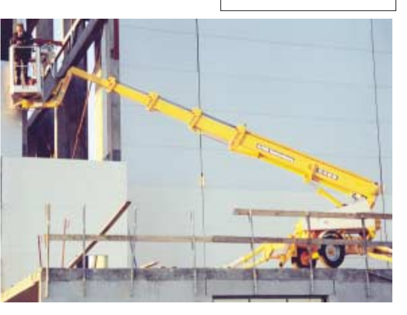
The Omme lift 2100E weighs just over two tonnes and reaches 21 metres, ideal for this job on an upper floor at the new Aarhus air terminal.

Another departure from recent trends is that JLG has placed most of the running gear, including batteries and motor on the chassis, this does help provide a lower centre of gravity, critical for smooth and stable roading but many producers have moved components up to the superstructure in order to better protect them from road spray. Both offer an unusually high towing speed of 65 mph, self levelling hydraulic outriggers and good outreach.