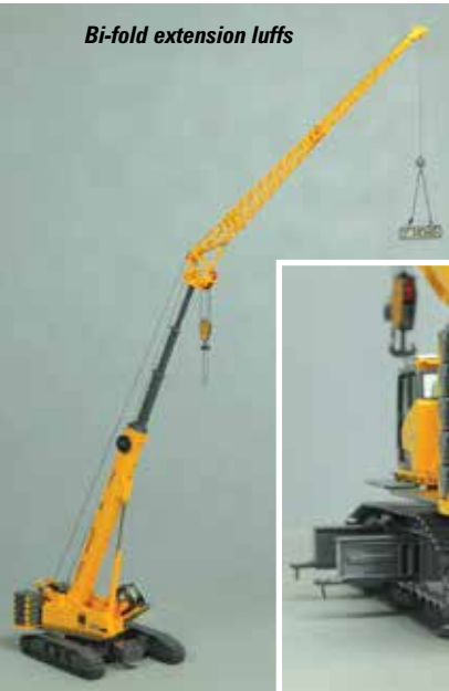
Bi-fold extension luffs