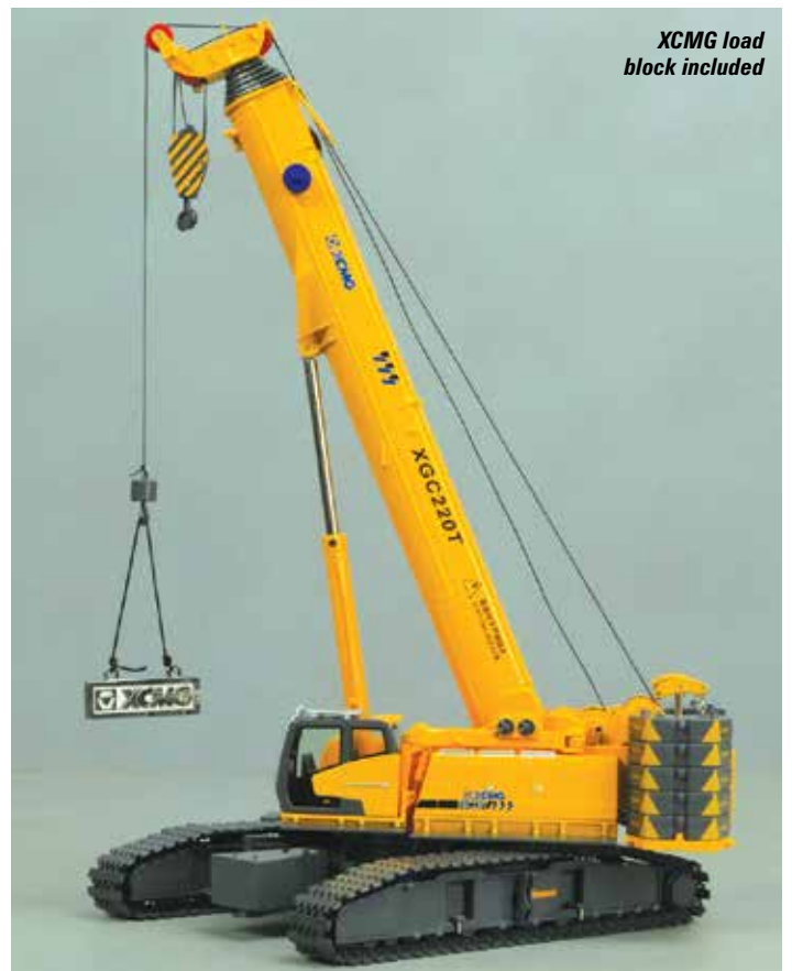
XCMG load block included