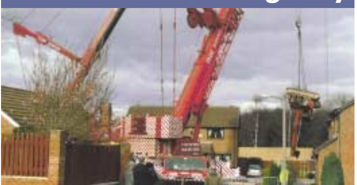
Crane Services to the rescue with 900 tonnes of lifting capacity.

Crane Services of Ossett, West Yorkshire was called on recently to rescue an excavator that had fallen down a large shaft on the edge of a housing estate. The incident was complicated by the fact that the excavator had been lifting a muck skip when it fell into the shaft and both had come to rest on top of a mini excavator that had been working in the shaft. The incident occurred around 2pm on Friday March second, Crane services immediately sent a team in to inspect the site and draw up a lift plan complete with