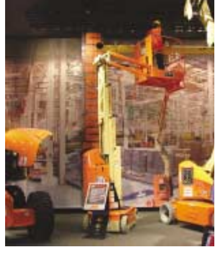
"The JLG-Toucan range set off against fantastic graphics on the inside of the JLG booth, if you missed Conexpo, you can see this stand at Intermat next year"