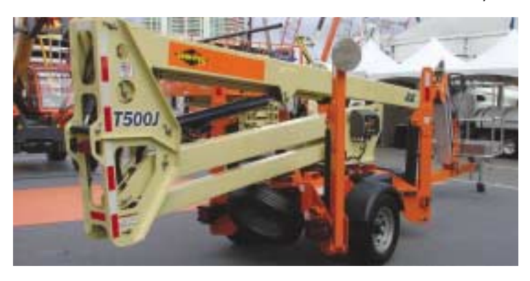
"The all new JLG T500J "Tow Pro" 17 metre trailer lift seen for the first time Conexpo"