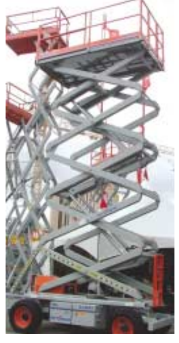
"Skyjack's mid range rough terrain scissors introduced last year are now in full production"

"Manitou was promoting its unique three wheel Twisco for applications such as landscaping"