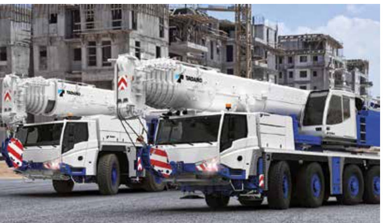
The upgraded 110 tonne Tadano AC 4.110-1 and 120 tonne AC 5.120-1