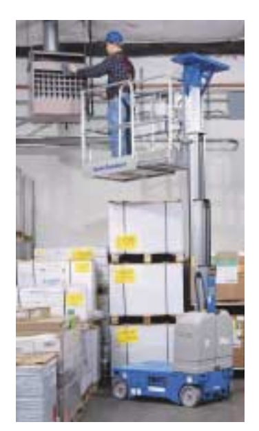
Genie Runabout will soon have a GR20 six metre model

Once again, this is a product that the rental companies and sales outlets have simply not taken to, and yet in Scandinavia rental companies run hundreds of them that often carry out work that 19- and 20-foot scissors do in the UK. The advantages of these small units is that they are lighter, have a much lower entry height, can be driven through a doorway without the operator leaving the platform,