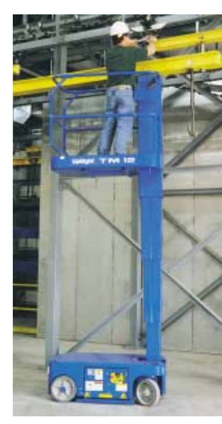
At the six-metre working height level, the lowest height sector with any serious volume in Europe, the market is still led by UpRight with its TM12.

The same company that makes the largest units, Holland Lift, also makes one of the smallest units. Its Mini Star model has a four-metre platform height, but its high price limits it to specialist applications. The mainstream suppliers in this sector include Skyjack, whose 6.5-metre working height SJ3215 weighs just 1,090 kilograms thanks to an innovative light-weight scissor arm construction and new platform construction. UpRight, Genie, Haulotte, Iteco and Snorkel also make similar units, although they tend to be heavier. One leading company JLG, no longer offers a 15-foot version of its ES micro scissor range.