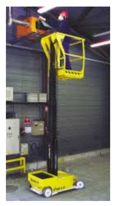
Haulotte Star 6 offers all steel construction

a 26-metre working height unit. The question remains, however, whether or not JLG will extend production up to the 30 metres plus units. This market is small and already well served by Holland Lift, a company much better suited to building and marketing these special, hand-built units. Watch this space!