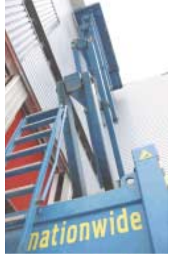
Nationwide Access recently supplied this 28-metre, 16-tonne diesel powered Liftlux LL26X to Donkin Roofing for cladding work on a 25-metre high steel framed bay pallet storage warehouse at Tilbury Docks.

and are short and light enough to fit in almost any lift.