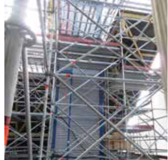
The Mound is supported by an intricate maze of Layher Allround modular system scaffolding