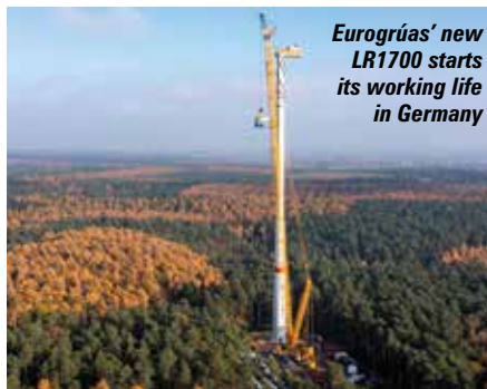
Eurogrúas' new LR1700 starts its working life in Germany