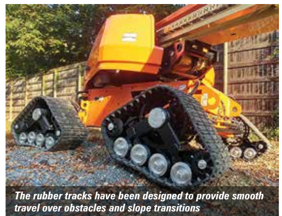
The rubber tracks have been designed to provide smooth travel over obstacles and slope transitions