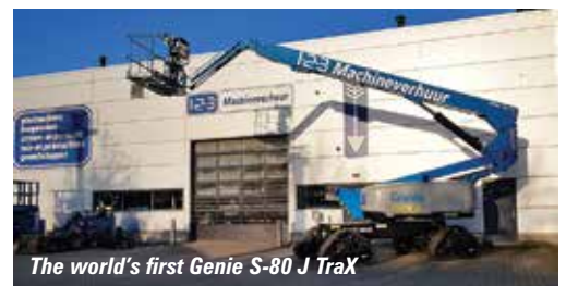
The world's first Genie S-80 J TraX

Using the same concept employed on the smaller Genie TraX boom lifts, the machines offer a working height of 26.4 metres and a maximum outreach of 16.7 metres with its 300kg unrestricted maximum platform capacity. Overall weight is just over 13 tonnes. Standard equipment on the new models includes two work lights, a secondary guarding system and Stage V diesel power, while the four independently controllable tracks have a steering angle of 30 degrees.