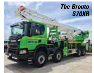
The Bronto S70XR