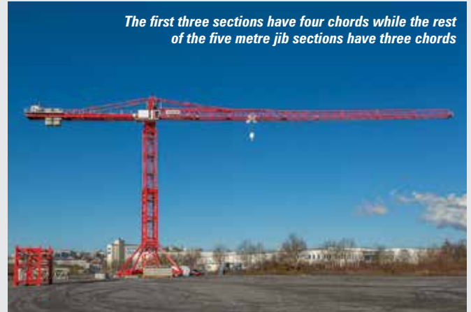
The first three sections have four chords while the rest of the five metre jib sections have three chords