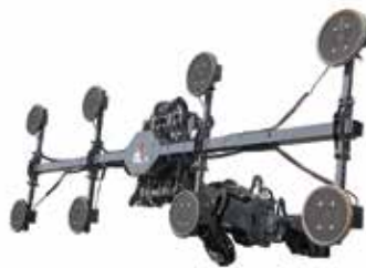
The new Dingli vacuum lifting head

Chinese aerial lift manufacturer Dingli has launched a new 1,500kg vacuum glass lifting head and conversion for its 86ft/26 metre BT2615ERTGS all-electric boom. The vacuum head is made up of eight autonomous vacuum pads which do not require tubes from a central pump. The modular design is based on a product the company launched in 2020 which has been extended from 500kg to 1,200kg and now 1,500kg.