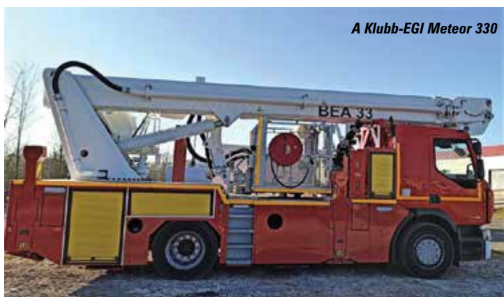
A Klubb-EGI Meteor 330

The Meteor 330 has a rescue height of 33 metres, an outreach of 25 metres and a basket capacity of 500kg and has been designed to rescue disabled or injured people including those on a stretcher. The platform is equipped with a cannon, rescue gangway, lighting and water curtain protection.