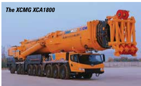
The XCMG XCA1800

The crane used the fully extended main boom plus around 60 metres of cable supported lattice extension for a maximum tip height of around 165 metres.