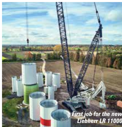
First job for the new Liebherr LR 11000

The crane's first job was installing a wind turbine with a hub height of 170 metres in Coesfeld in North Rhine Westphalia. At the same time Wasel also took delivery of the first 700 tonne Liebherr LR 1700-1.0 crawler crane.