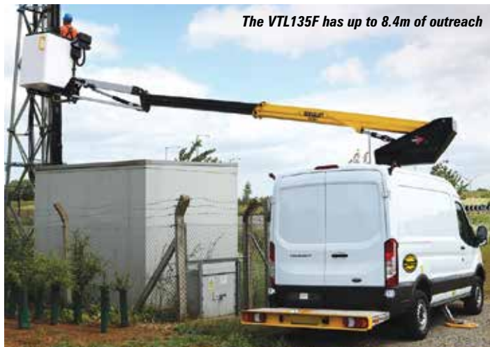
The VTL135F has up to 8.4m of outreach

The Versalift VTL135F claims to offer one of the best outreaches on the market at 8.4 metres with 120kg in the basket, while the maximum platform capacity is 230kg available at an outreach of up to seven metres. The unit also features a jib with 140 degrees of articulation. All vans are equipped with an onboard ultra-violet disinfecting light.