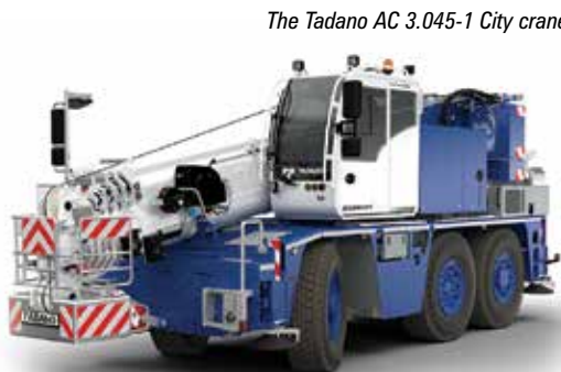
The Tadano AC 3.045-1 City crane