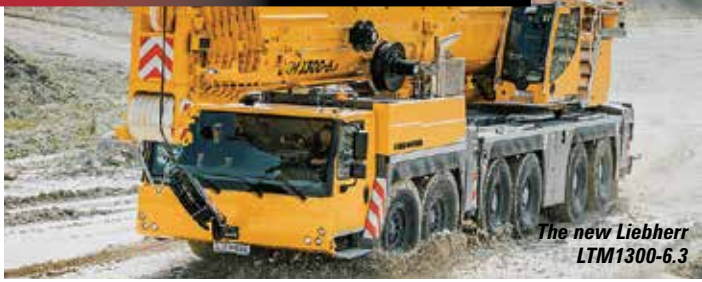
The new Liebherr LTM1300-6.3