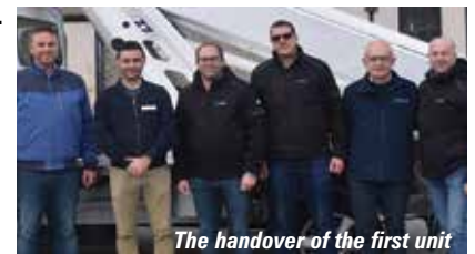
The handover of the first unit

Features include Multitel's MUSA system which monitors outrigger positions, platform load and slew position to automatically calculate the working envelope. The machines, purchased through Multitel distributor Skyworker, will be delivered between now and 2025.