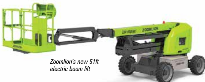
Zoomlion's new 51ft electric boom lift

Power comes from a 48 volt 320A/h battery pack feeding AC electric drive and lift motors with four wheel drive and oscillating axle. The unit has an overall width of 2.3 metres, an overall length of 7.7 metres and a stowed height of 2.3 metres. Total weight is 7,300kg. The standard specification includes secondary guarding and a full on-board diagnostics package with 4.3 inch display.