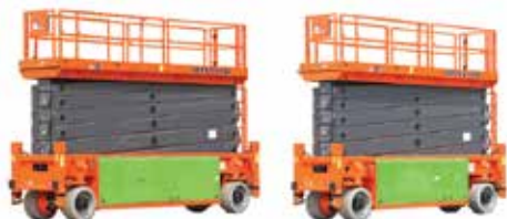
The two new Dingli heavy-duty scissor lifts

A 1.9 metre roll-out extension creates a 7.75 metre long work platform on the JCPT3214 and just under seven metres on the JCPT2814. Both can drive at full height and in spite of these being slab electric machines, four wheel drive and steer are standard. Power comes from an 80 volt/520Ah high-capacity lithium battery pack feeding AC motors which are said to be good for three to four days of typical work. A 620Ah full traction battery option is also available.