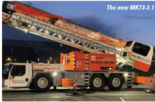
The new MK73-3.1

It has a maximum capacity of six tonnes at a 12 metre radius, while the maximum radius is 38.5 metres with a capacity of two tonnes at a height of 26.5 metres. Launched last summer, the MK73-3.1 is the company's first mobile self-erector and will be based in the Paris area.