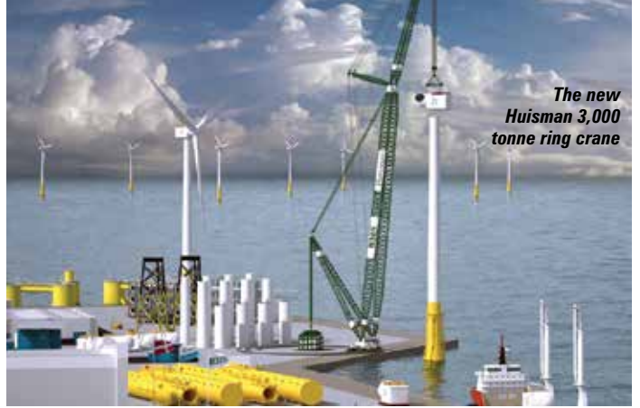
The new Huisman 3,000 tonne ring crane