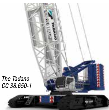
The Tadano CC 38.650-1

The big crawler is rated at a 12 metre radius and comes with a 171 metres of main boom and a 193 metre maximum tip height. The rest of the order is made up of a 45 tonne AC 3.045-1 City crane with E-Pack electric power and five Tadano GR Rough Terrain cranes. The company also ordered a Boom Booster kit for its Demag/Tadano CC cranes.