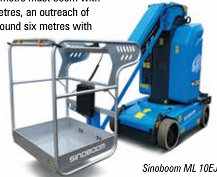
Sinoboom ML 10EJ

The new lift is a classic 10 metre mast boom with a working height of 10.3 metres, an outreach of 3.3 metres at a height of around six metres with a platform capacity of 200kg. Overall width is 990mm, overall height of 1.9 metres and an overall length of just under three metres. Overall weight is 2,678kg.