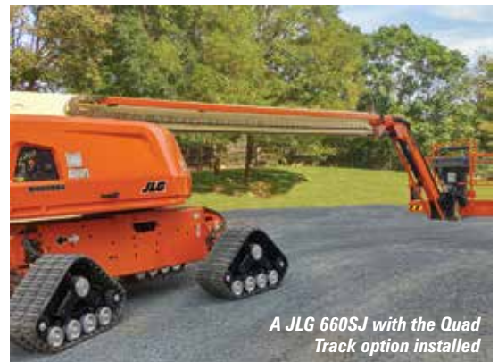
A JLG 660SJ with the Quad Track option installed

Quad Track - which will initially only be available on ANSI machines - uses four low profile 457mm wide triangular rubber track systems, each of which is 834mm high and 1.37 metres long with four lower rollers. They bolt directly onto the standard machine's wheel hubs allowing easy conversion from wheels to tracks and back again.