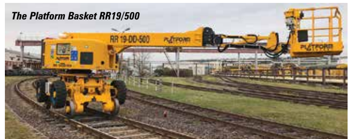
The Platform Basket RR19/500

The new boom features a three section boom with internal hoses and cables, topped by an articulating jib. It is a big brother to the 14 metre RR14/400 with similar features such as Euro V diesel power, auxiliary engine, independent hydrostatic transmission, four wheel drive for both road and rail wheels, four wheel steer, oscillating axles and automatic superstructure levelling to allow work on tracks with up to 200mm of cant. Slew is 360 degrees - 180 degrees either side - with a maximum travel speed of 19kph when stowed.