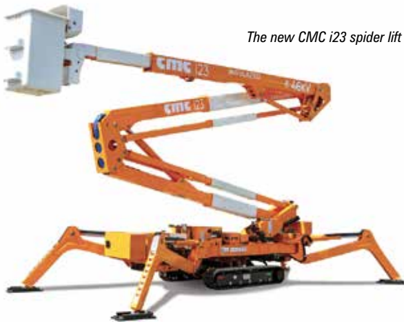
The new CMC i23 spider lift

The new models are aimed at a variety of users for applications such as power line work, industrial maintenance and tree pruning where overhead power lines may be present.