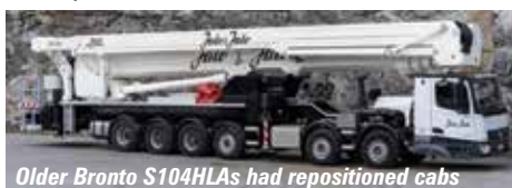
Older Bronto S104HLAs had repositioned cabs