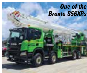
One of the Bronto S56XR's

All eight platforms are mounted on Scania P 410 four axle 8x8 chassis and are loaded with optional equipment such as radio remote controls, hydraulically extendable 600kg work platforms, detachable platform mounted winches, a hydraulic superstructure mounted generator and an emergency back-up system. The S70XR also features 440 degrees of platform rotation.