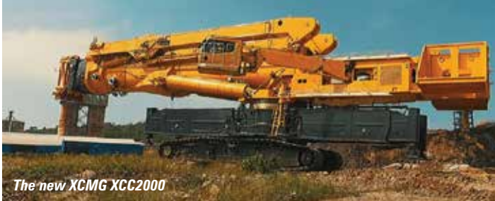
The new XCMG XCC2000