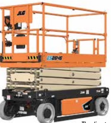
The direct electric drive ES2646

The two units feature JLG's 'Variable tilt' system which extends the working envelope on sloping ground. On these units it allows operation on side slopes of up to 2.5 degrees and longitudinal slopes of up to 3.5 degrees. Total weight of both models is 2,400kg. Options include JLG's Mobile Controller and QuikFold guardrails, while the ES2646 is also available with the CleanGuard leak containment system.