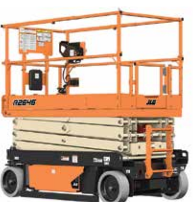
The hydraulic drive R2646