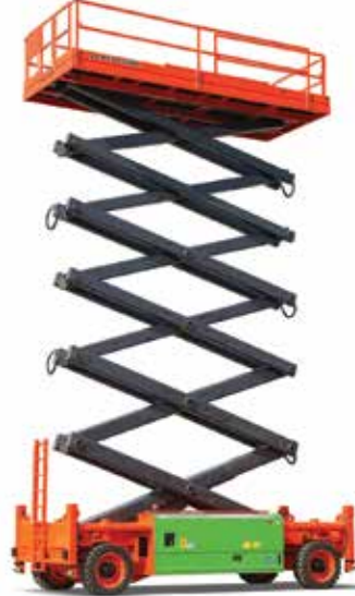
The new JCPT3225DC

Dingli has launched wide versions of its biggest scissor lift model in the form of the JCPT3225DC and JCPT3225RT. The new machines offer a working height of 32 metres and utilise the same scissor stack as the 99ft JCPT3214DC narrow slab electric models unveiled in January. The heavy duty stack is mounted on a 2.5 metre wide chassis with four wheel electric drive motors on the DC model and hydraulic wheel motors on the RT. Rough Terrain non marking tyres and four wheel steer are standard on both.