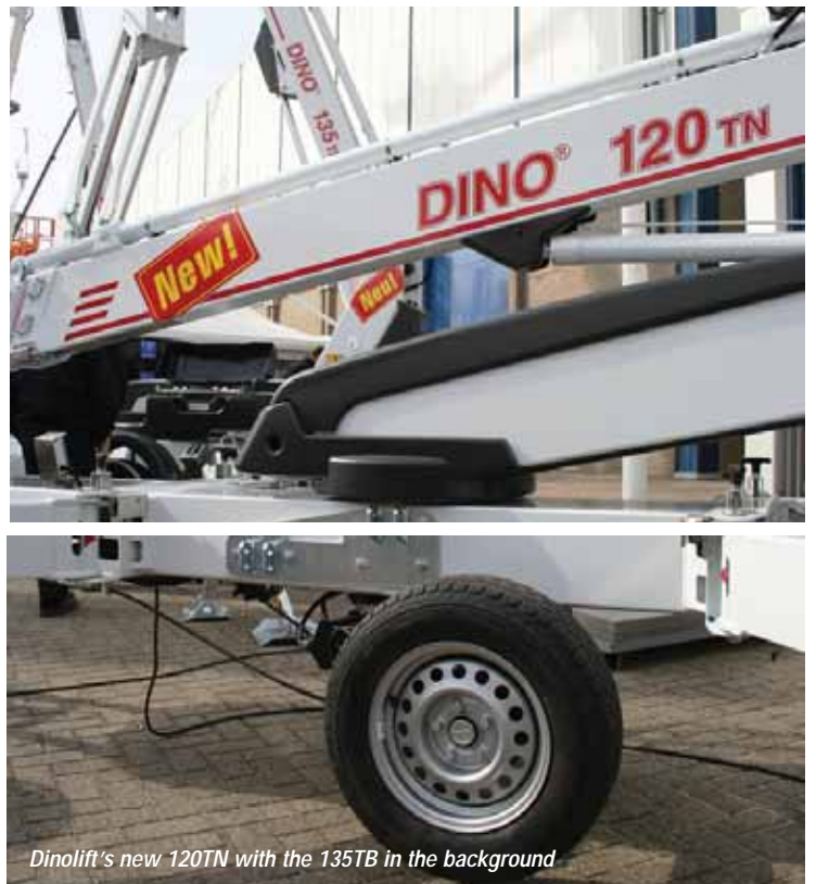
Dinolift's new 120TN with the 135TB in the background

battery powered versions of its existing models, the 135TB, 150TB and 180TB. Large truck mounted manufacturers were out in force with Palfinger making the most of its recent acquisition of Wumag by having the world's tallest platform -