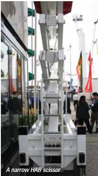
A narrow HAB scissor

with the new 68ft/20.5 metre platform height model with automatic self leveling jacks as well as its narrow, 1.2 metre Top12 range and its compact articulated Dino boom lift range. The company