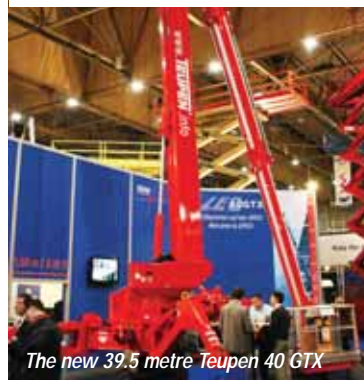
The new 39.5 metre Teupen 40 GTX

Italian truck mount manufacturer CTE showed off its new Z21 which is already in production. With a working height of just under 21 metres the 3.5 tonne platform combines a sigma-style dual riser with telescopic top boom and articulating jib with 9.2 metres outreach and 200kg lift