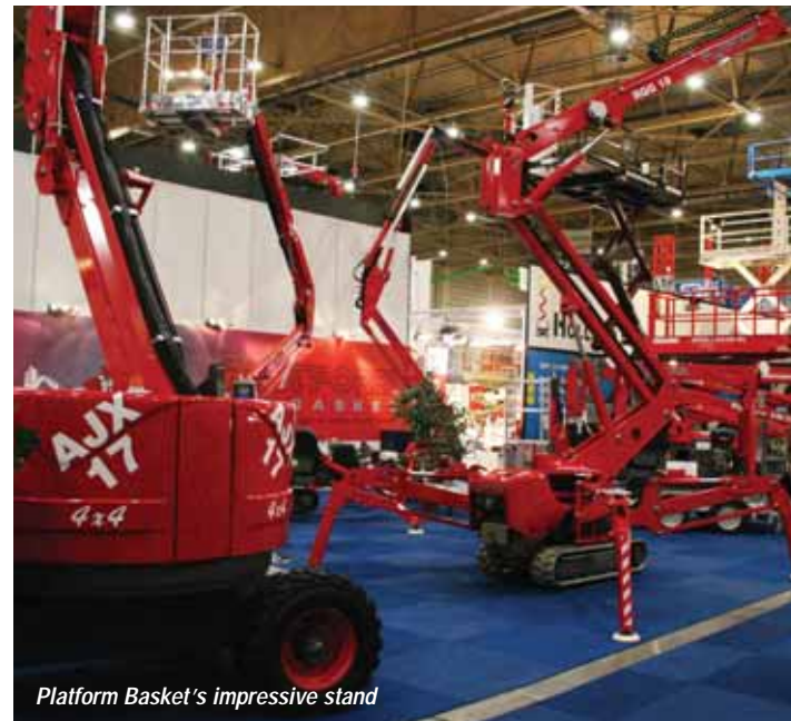
Platform Basket's impressive stand