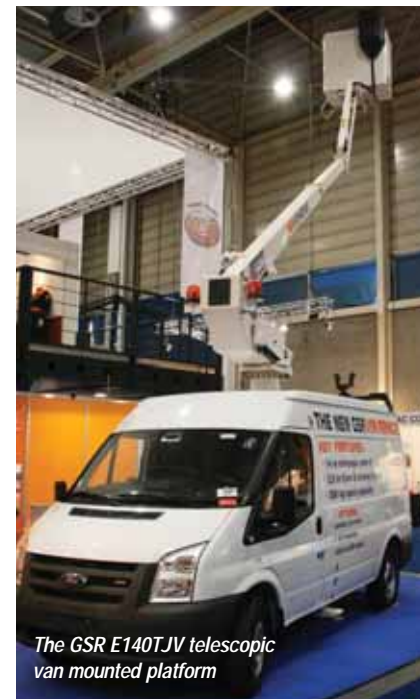
The GSR E140TJV telescopic van mounted platform

"The market for these van mounted machines is not dependent on the construction market and therefore our forecast is optimistic," said Weber. "The UK is a major market for us and we have a sizeable order in the pipeline for the new van mount and other machines. We are optimistic for next year and will add more models to the 16 metre range. The 29 metre truck mount has also been a best seller this year."