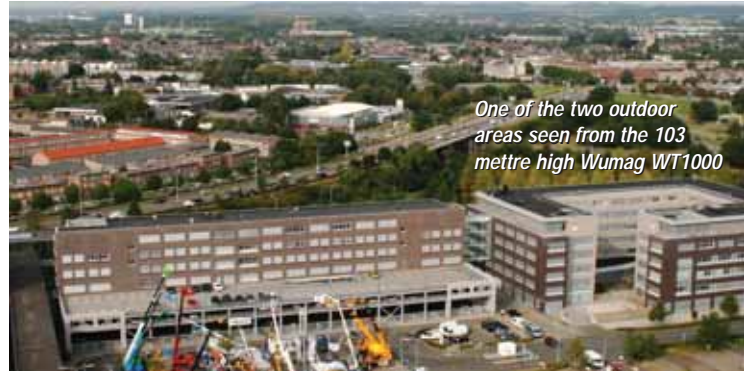
One of the two outdoor areas seen from the 103 metre high Wumag WT1000