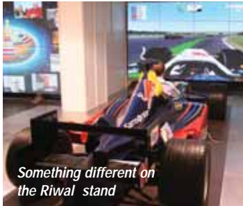
Something different on the Rival stand

the scissors on display were built at Manitou's plant in China. Platform Basket had a large stand with the focus on a new spider lift the 18 metre variable width Spider 18.75 the machine retracts to 750mm to pass through the narrowest of doors then extends to over a metre wide to ensure good stability while