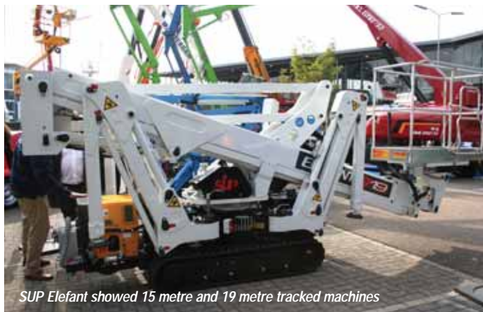
SUP Elefant showed 15 metre and 19 metre tracked machines

Southern German producer HAB also showed a big scissor lift - the prototype S240-25 4WDS with a 67ft/22 metre platform height - with a 28 metre unit on the drawing