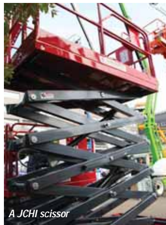
A JCHI scissor