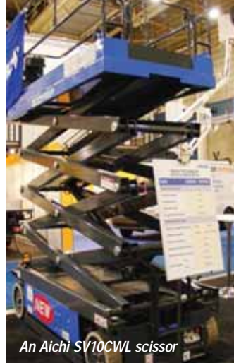
An Aichi SV10CWL scissor

board. On its indoor stand the company showed a 43ft/13 metre S154-18E4WDS, RT scissor. HAB currently sells in Switzerland, Austria, Germany and Holland and builds around 60 booms and 100 scissors a year. Conti Corrado of Iteco said that the company is looking to reach UK rental companies with its latest machines the 50ft/15 metre platform height IT 14210 and 56ft/17 metre 17210 - the largest scissor lift it has ever built. The new units are available with either battery or diesel power, feature a two metre deck extension, can be used indoors or outdoors and include over-centre steering for a 90 degree crank angle.