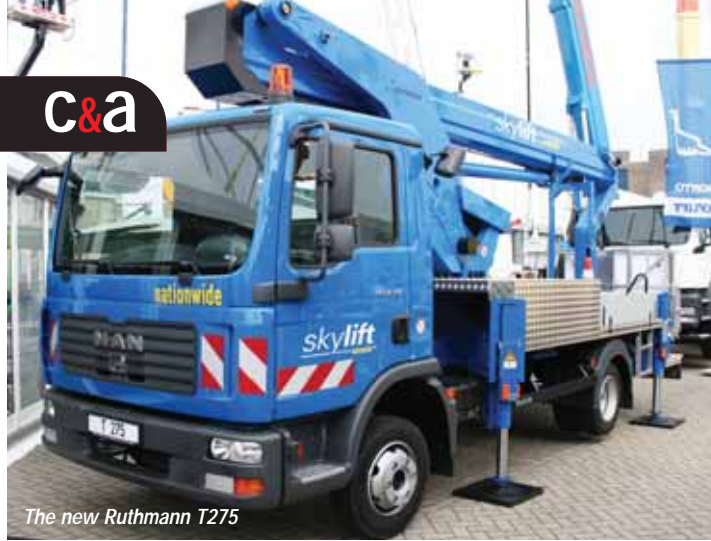
The new Ruthmann T275

Ruthmann claims that its 58 metre working height - 40 metre outreach T580 is now the leader in its sector. The latest development is the 47 metre working height, 32 metre outreach T470 on an 18 tonne, two axle chassis, followed by a T450 to replace the old machine of the same name. Ruthmann says that it has doubled its revenues over the past five years to €55 million which