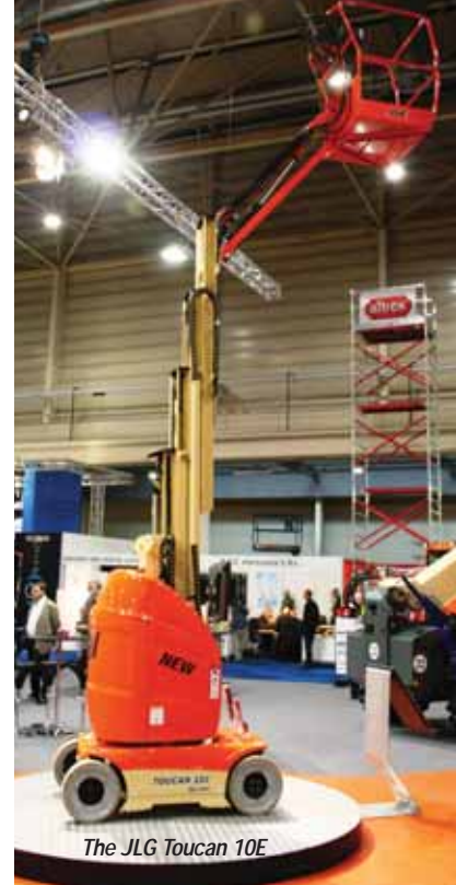
The JLG Toucan 10E

Italian truck mount manufacturer CTE showed off its new Z21 which is already in production. With a working height of just under 21 metres the 3.5 tonne platform combines a sigma-style dual riser with telescopic top boom and articulating jib with 9.2 metres outreach and 200kg lift