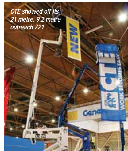
CTE showed off its 21 metre, 9.2 metre outreach Z21