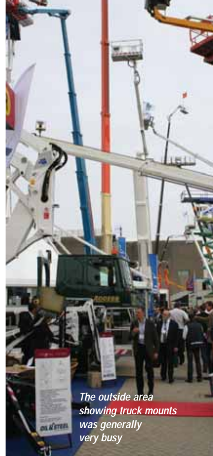
The outside area showing truck mounts was generally very busy

UpRight unveiled five new products at the show, the most impressive of which was the 80ft narrow aisle diesel powered scissor lift, the X80ND - built by Omega lift in Holland for UpRight as is another of the new launches the crawler mounted X28T. Another joint venture was the 24ft trailer mounted scissor from PLE in the USA, which UpRight will assemble at its UK plant, finally the