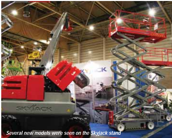
Several new models were seen on the Skyjack stand