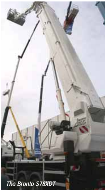
The Bronto S78XDT