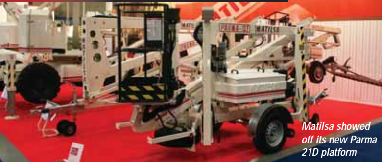
Matilsa showed off its new Parma 21D platform