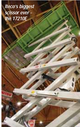
Iteco's biggest scissor ever - the 17210E

says that it is looking at introducing larger scissors, including a 25 metre and possibly a 29 metre model as well as a special 17 metre All Terrain lift weighing around five tonnes. Look out for the new launches in August 2009.