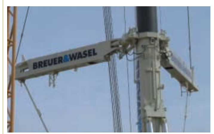
Liebherr's 'Y-Guy' boom suspension system

Terex also said that in Liebherr's efforts to overturn the Demag patents, the German patent and trademark office had already reached a first instance decision in January on one such action in favour of Terex, and that the Mannheim regional court took this into consideration when ruling.