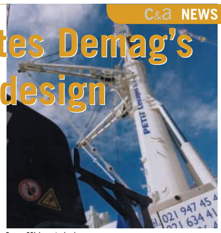
Demag SSL boom technology

Liebherr has made it clear that it will continue to produce and deliver its Y-Guy lateral support system for telescopic cranes despite the possibility of facing fines of up to \leqslant\!250,\!000 per incident and up to six months imprisonment, with a maximum limit of two years, usually served by the managing director, if it continues to do so.