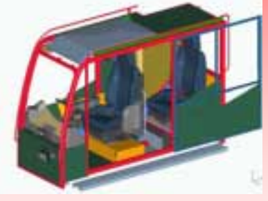
Two seat cabin Operator friendly

Terex-Demag Ltd Great West House Great West Road Brentford, Middlesex, TW8 9DF Tel: 0044 208 231 8510 Fax: 0044 208 231 8610 email: barry.barnes@terex-demag.com www.terex-cranes.com