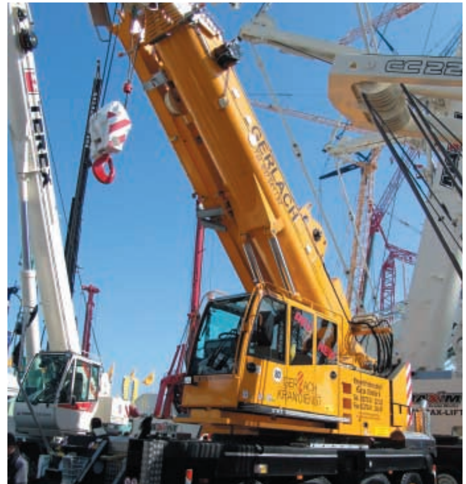
Terex-Demag's AC 70 launched at bauma 2004 replaces the 60 t capacity AC 60 and offers increased lifting capacity by way of an additionally mountable counterweight plate, also used on the new AC 55.

come to an end on December 1, this year. "Three orders for this machine were taken from UK customers during bauma with others to follow shortly," says Evans.