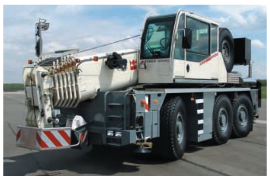
Terex-Demag's new AC 55 with the classic city 'drop-nose' boom concept first seen on Kobelco's twoaxle, 7 t capacity RK70 introduced in 1989.

The UK market is also one that Italy-based, Locatelli, has its eye on with its Europeandesigned (which suggests why the company is yet to sell in the UK) 20 t capacity ATC 20 city unit. The ATC 20 comprises a six-section, 23.8