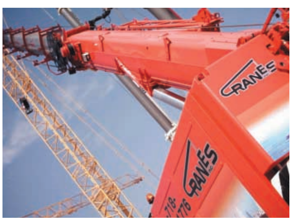
Liebherr's LTC 1055 in the colours of US-based Cranes Inc at bauma 2004.

The advent of city crane was seen by some as an evolution of the all-terrain (AT) crane, or a combination of the rough terrain (RT) and AT crane, but with essential differences, such as a