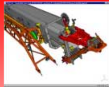
Low headroom runner (part of jib) 25.9t