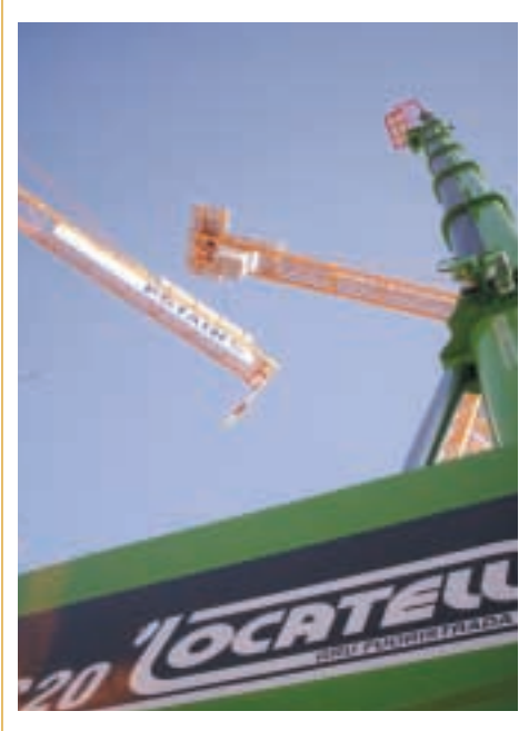
Locatelli has delivered more than 50 units of its AC 20 since its launch at bauma 2001.

and duties of the AT," - 43 m with pin-lock on the latest GMK 3055, or an alternative full-power on the GMK 3050-1.