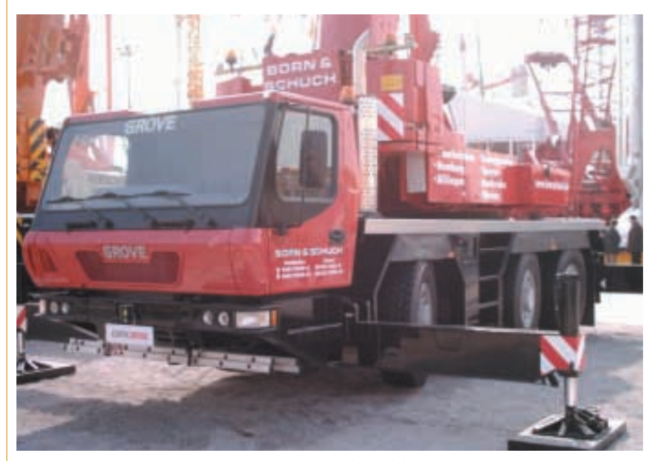
Deliveries of Grove's new 55 t GMK3055 have begun with recipients including the Terranova, Sutch and King Lifting in the UK and Meade in Ireland. Pictured is Germany-based firm Born & Schuch's new unit displayed at bauma 2004.

m hydraulic boom, which is fully electronically controllable through Locatelli's Locatronic internal control system, which also controls all crane motions. The company has delivered more than 50 units since its launch at bauma 2001, and says that speeds in excess of 70 km/h on a road or highway make this unit popular among customers.