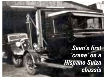
Saan's first 'crane' on a Hispano Suiza chassis