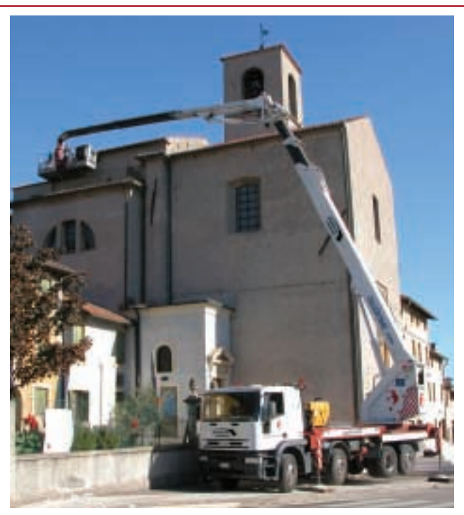
PANTHER PLATFORM Rentals has purchased what will be the UK's first Oil & Steel Eagle 4430 truck mounted platform, to be handed over to the company at Bauma 2004. The 44 metre working height platform provides 30 metres of outreach and features a jib that can be angled up to plus 170 degrees, and also a 360 degree rotating turret.