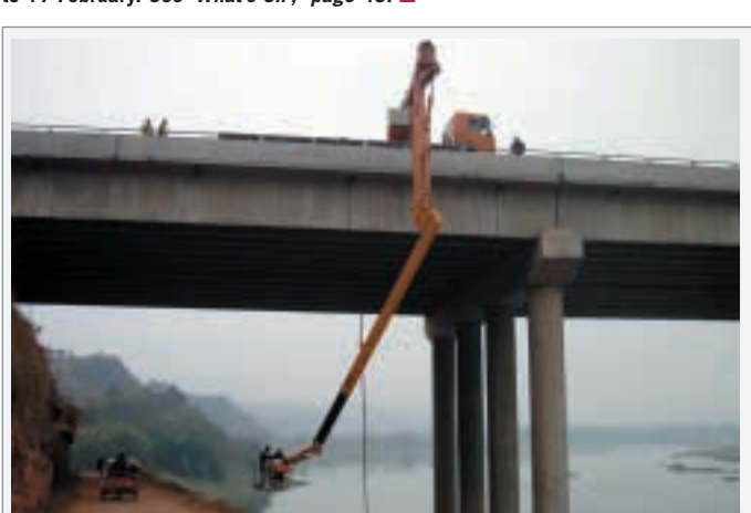
ITALY-BASED PLATFORM producer, Barin SpA, has delivered one if its AB 17 under-bridge inspection units to Sichuan Chengnan of China for inspection and maintenance work on the Chengdu-Nanchong expressway project. The unit, mounted on a Volvo FM12 LHD, 8 x 4 truck chassis, provides a horizontal underbridge reach of 17 metres and a vertical underbridge depth of 21 metres. ■

Next year's Rental Show is scheduled to take place in Las Vegas between 14 to 17 February. See 'What's On', page 46. ■