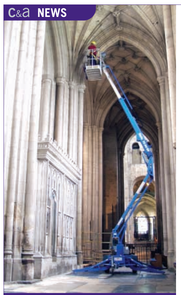
HAMPSHIRE PLANT recently supplied Winchester cathedral with this 12.36 metre Genie TZ-34/20 trailer mounted boom to help with re-wiring work for the building's sound system. ■