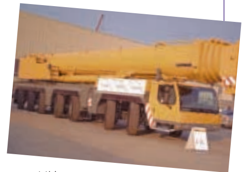
Liebherr's 1400/1 all terrain