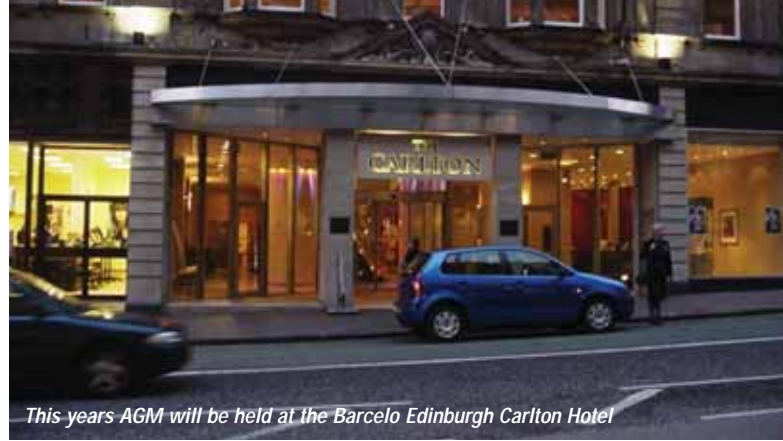
This year's AGM will be held at the Barcelo Edinburgh Carlton Hotel