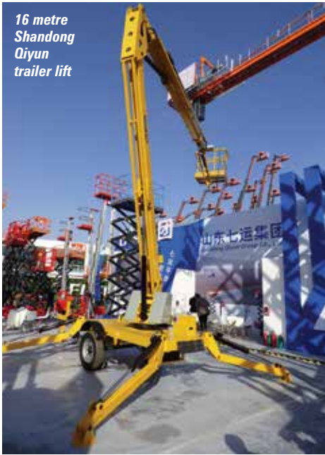
16 metre Shandong Qiyun trailer lift