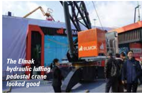
The Elmak hydraulic luffing pedestal crane looked good