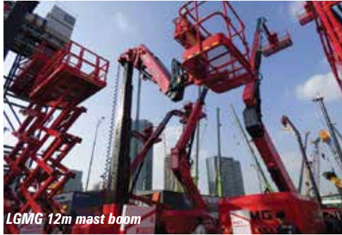
LGMG 12m mast boom