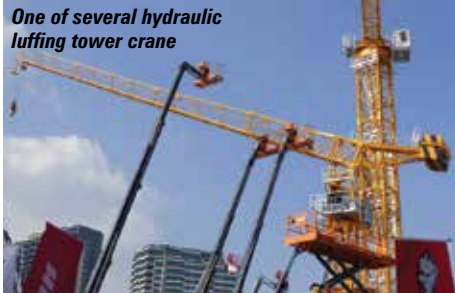
One of several hydraulic luffing tower crane