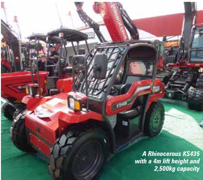
A Rhinoceurus KS435 with a 4m lift height and 2,500kg capacity