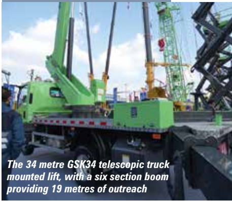
The 34 metre GSK34 telescopic truck mounted lift, with a six section boom providing 19 metres of outreach

Others included a 34 metre telescopic truck mounted lift, the GKS34, with a six section boom providing 19 metres of outreach and a GVW of 7.2 tonnes, and the 66ft - 22 metre working height - electric Rough Terrain scissor lift, the XG2225ERT.