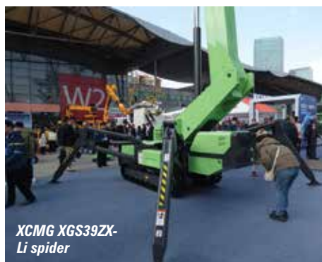
XCMG XGS39X-Li spider

XCMG had plenty of new aerial lifts on show, including a 39 metre lithium battery powered telescopic spider lift - the XGS39X-Li - with 16.5 metres of outreach, a 2.4 metre platform with dual 120/230kg platform capacity and an overall weight of 8,700kg.