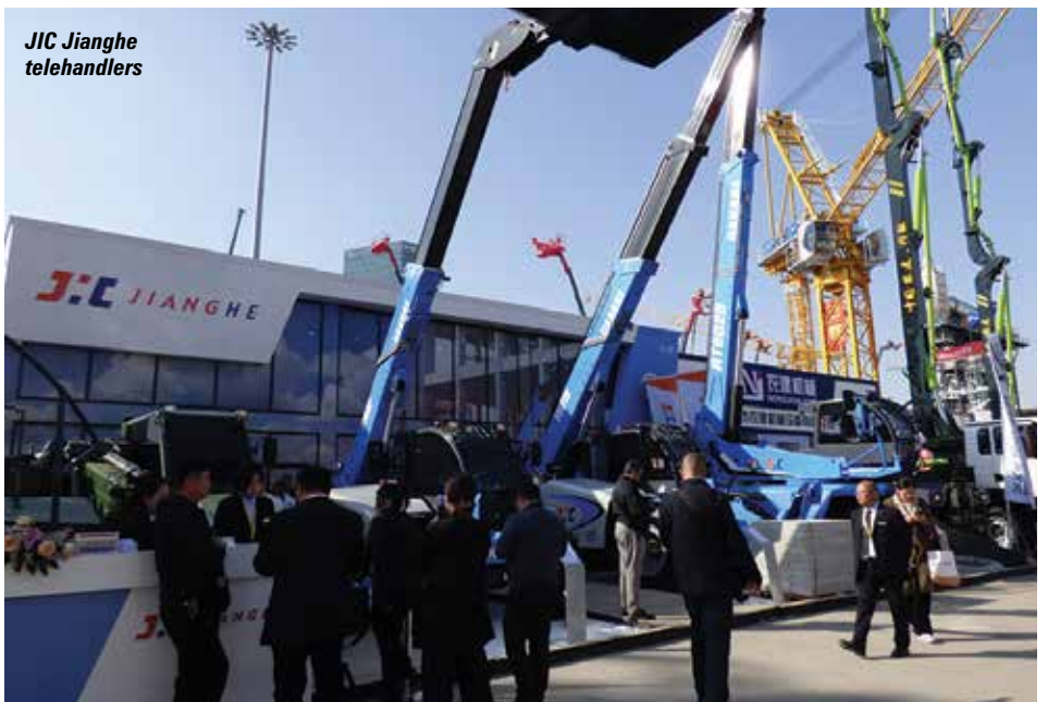
JIC Jianghe telehandlers