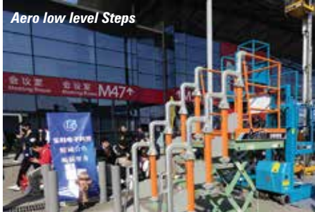
Aero low level Steps