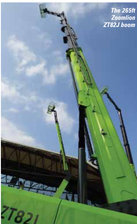
The 265ft Zoomlion ZT82J boom

Among the stand out products were new record breaking boom lifts, topped by Zoomlion's 265ft ZT82J boom lift the world's largest self-propelled lift taking over from XCMG's 223ft XCMG XGS70K telescopic. Scheduled for launch next year it features a six section main boom topped by a 13.1 metre, three section articulating jib for working heights of up to 82.3 metres. The maximum outreach is 34.1 metres with 230kg, while the maximum platform capacity is 454kg.