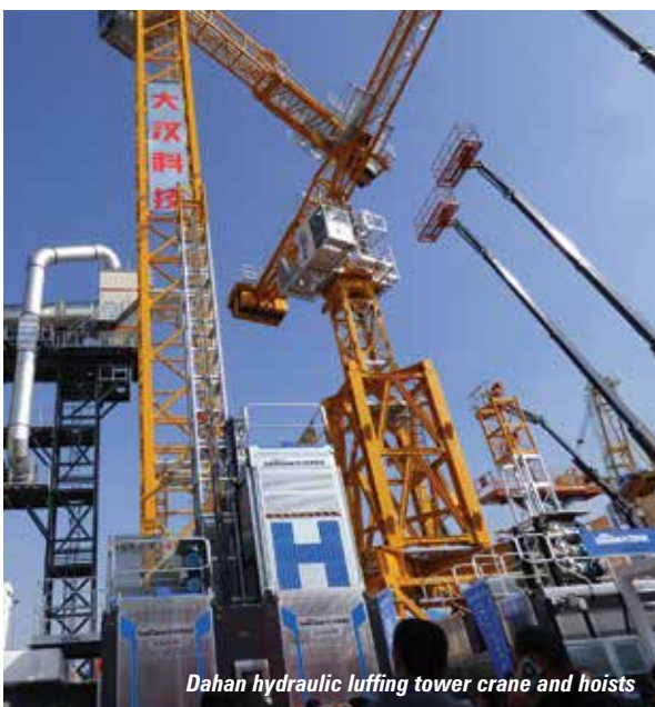
Dahan hydraulic luffing tower crane and hoists