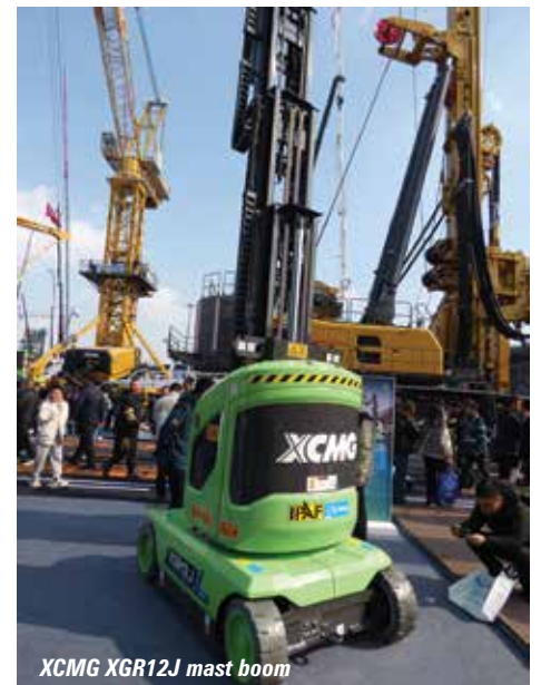
XCMG XGR12J mast boom

At the smaller end was the 12 metre XGR12J mast boom, with open mast design and telescopic jib, for a 12.7 metre working height and 5.7 metres outreach with 200kg platform capacity - total weight is 4,980kg.