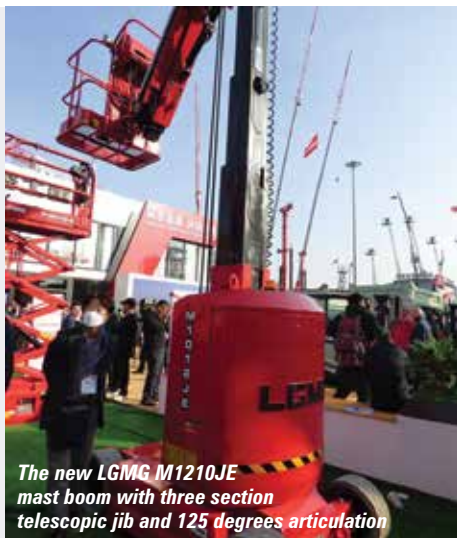
The new LGMG M1210JE mast boom with three section telescopic jib and 125 degrees articulation

The following is more of a pictorial review with many of the launches covered in future issues of Cranes & Access.