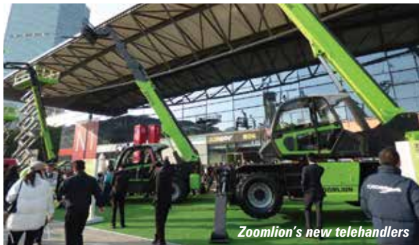
Zoomlion's new telehandlers