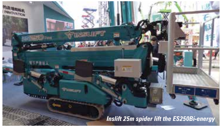
Inslift 25m spider lift the ES250Bi-energy