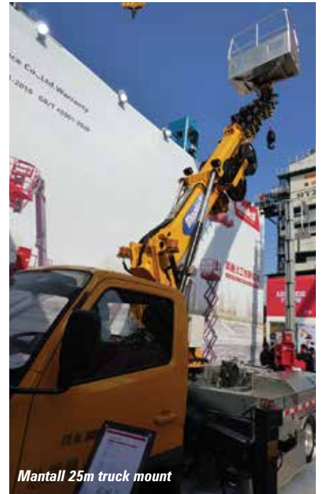
Mantall 25m truck mount