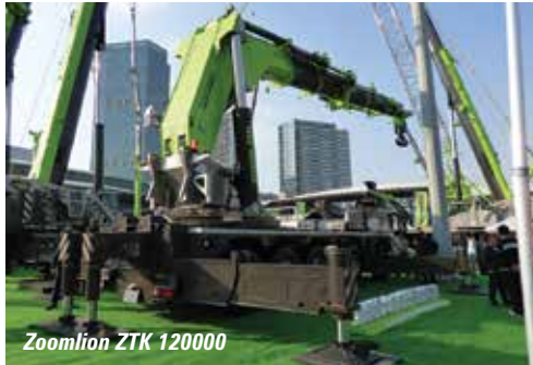
Zoomlion ZTK 120000