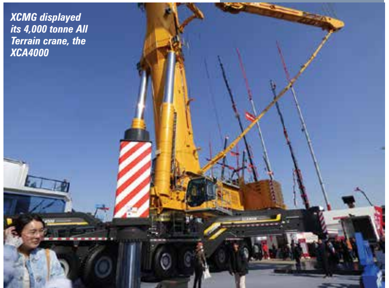
XCMG displayed its 4,000 tonne All Terrain crane, the XCA4000

a dozen of them with classic rigid frame and 360 degree models on display. A little strange given that China's domestic market is almost non-existent.