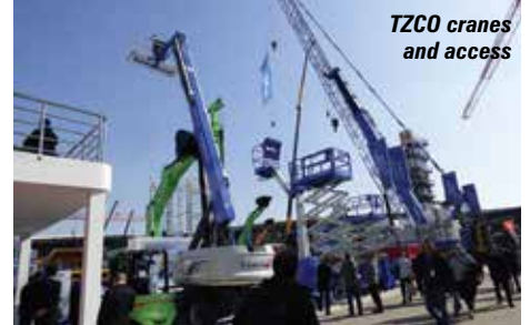
TZCO cranes and access