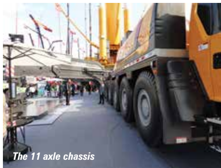
The 11 axle chassis

XCMG displayed its 4,000 tonne 11 axle All Terrain crane, the XCA4000, which it began shipping earlier this year. It was recently joined by the nine axle, 4,000 tonne, Sany SAC40000T which was not on display.