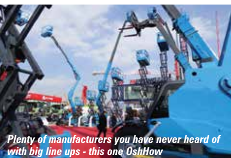
Plenty of manufacturers you have never heard of with big line ups - this one OshHow