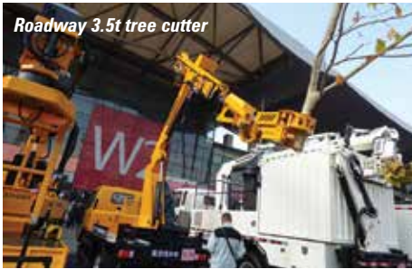
Roadway 3.5t tree cutter