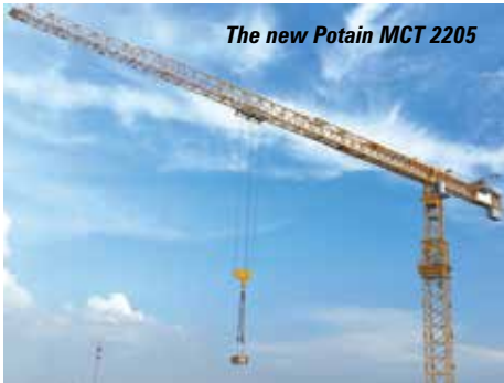
The new Potain MCT 2205

Potain launched its largest flat top tower crane to date, the 80 tonne MCT 2205. The first eight have been sold to Abu Dhabi based tower crane group NFT. The MCT 2205 can be rigged with an 80 metre jib with jib tip capacity of 23.6 tonnes.