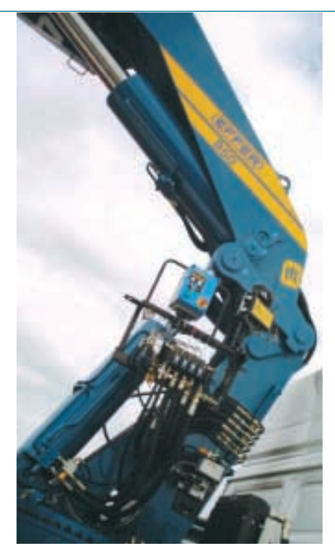
Effer says that its 100 tonne metre class model 950 is the biggest ever knuckle boom to be sold into the UK.

version joins an electric narrow version and a sub 3 tonnes electric Lite version in UpRight's now 3-strong AB38 range. The boom was joined, along with a selection from the company's existing scissor lift, trailer mount and self propelled boom lines, by the new Snappy Junior light weight, mini work platform for the tool hire and DIY markets.