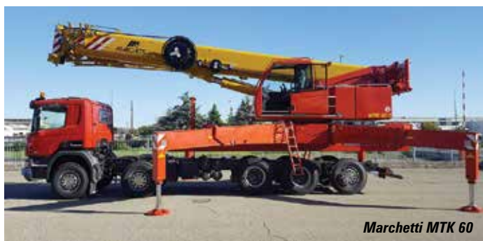
Marchetti MTK 60