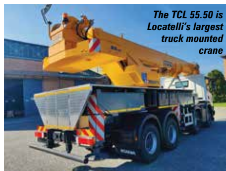
The TCL 55.50 is Locatelli's largest truck mounted crane

Zoomlion offers numerous smaller capacity models mounted on commercial chassis with capacities ranging from 12 to 50 tonnes. These start with the 12 tonne ZTC121V461 which offers a 39 metre maximum tip height up to the 25 tonne ZTC252E562-2 with a 53 metre tip height and the 25 tonne ZTF250V42, with a 44 metre maximum tip height. Biggest is the 50 tonne ZTC500A562 with a 45 metre maximum lift height. ■