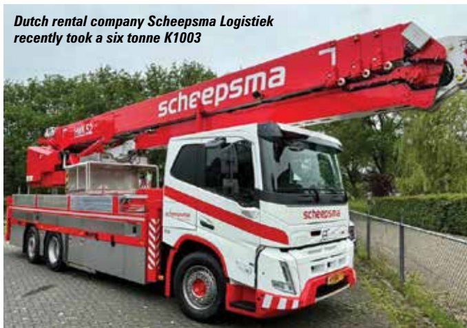
Dutch rental company Scheepsma Logistiek recently took a six tonne K1003

The latest cranes in its range include the three tonne K2500 - which replaces the K1100 - and the 4.5 tonne K2300. The K2500 features a three section hydraulic folding jib for a 59 metre maximum tip height. The maximum outrigger spread is seven metres, while the maximum