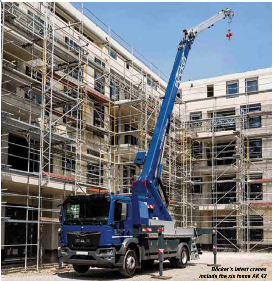
Böcker's latest cranes include the six tonne AK 42

The AK 36 is the most compact in the series with a 4.16 metre wheelbase. In standard form the crane has a two tonne nominal capacity, but this can be increased to four tonnes. Boom lengths of up to 36 metres with the option of 37.9 metres