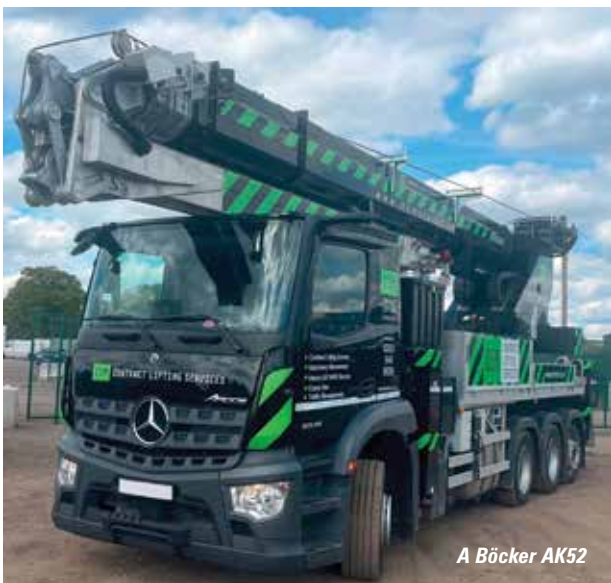
A Böcker AK52

In order to provide the power required Böcker adopted a similar technology to the latest mobile self-erecting tower cranes which employ a battery pack between the main input and the