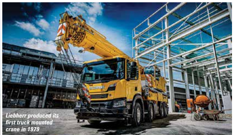
Liebherr produced its first truck mounted crane in 1979