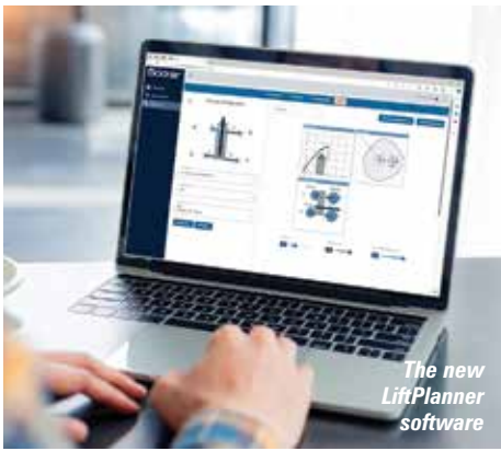
The new LiftPlanner software

expected ground pressure for each outrigger. Simulation results can be saved for each project and exported as a PDF which includes all planned parameters and can also be used for authorisation.