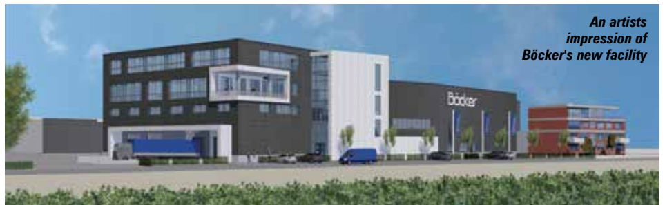
An artists impression of Böcker's new facility

Both of the 'aluminium' truck mounted crane