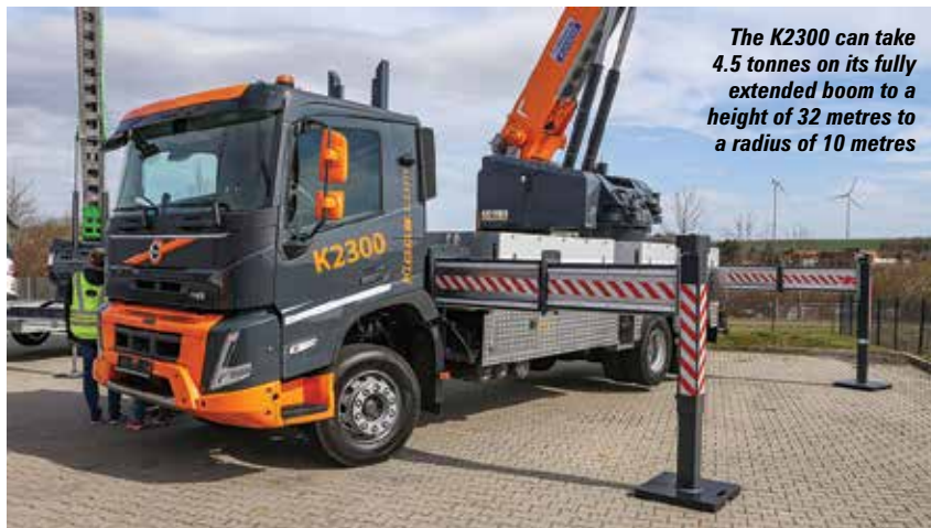
The K2300 can take 4.5 tonnes on its fully extended boom to a height of 32 metres to a radius of 10 metres

crane's drive line. Designed to be more energy efficient than its high voltage predecessor, when combined with the unit's lithium-ion battery pack it provides continuous operation with the charger topping up the batteries as rapidly as the crane draws power. The crane can also be operated from the diesel chassis via the usual Power Take Off system.