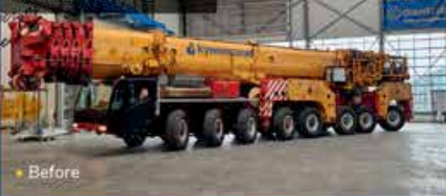
Tadano AC 500-2