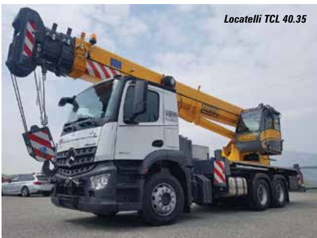
Locatelli TCL 40.35

The configuration options include various outrigger positions, boom length, elevation angle and slew position along with the weight of the load. Buildings or obstacles can easily be added in and displayed, as can the dimensions of the load and lifting gear dimensions and weight. With the planned parameters entered, LiftPlanner shows the crane's permissible working range and uses colour codes to warn of challenging or impossible configurations. It also calculates the