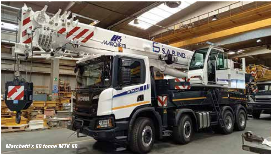
Marchetti's 60 tonne MTK 60