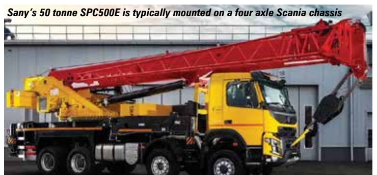
Sany's 50 tonne SPC500E is typically mounted on a four axle Scania chassis