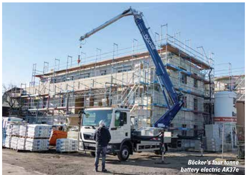
Böcker's four tonne battery electric AK37e