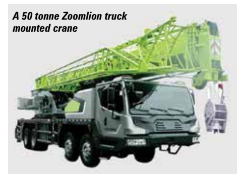
A 50 tonne Zoomlion truck mounted crane