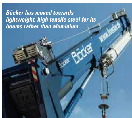
Böcker has moved towards lightweight, high tensile steel for its booms rather than aluminium

The secret of this type of truck crane lies in the lightweight boom system, substituting the structure required for high nominal and close radius capacities for long booms and good capacity at height and reach. This also allows