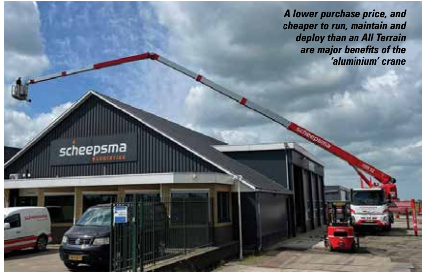
A lower purchase price, and cheaper to run, maintain and deploy than an All Terrain are major benefits of the 'aluminium' crane