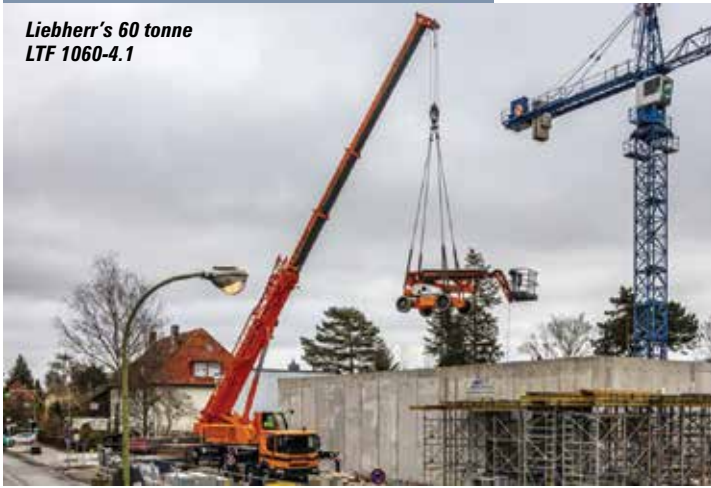
Liebherr's 60 tonne LTF 1060-4.1