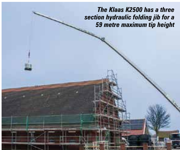
The Klaas K2500 has a three section hydraulic folding jib for a 59 metre maximum tip height