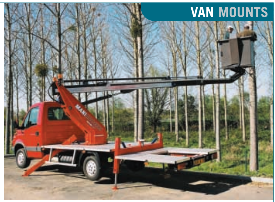
Manitou's maiden voyage into the van mount sector sets sail with the launch of the models MOB 130 and MOB 171 from its Mobile Access series. Pictured is the 17 metre working height MOB 171.

At just about this time last year, C&A reported that the vehicle mounted hire sector was 'getting very hot'. And, taking into account the scale of investment by the sector's manufacturers recently and the growing demand from end users, things are still looking good 12 months down the line.