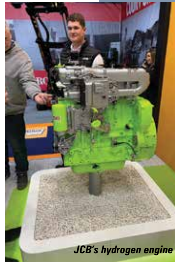
JCB's hydrogen engine