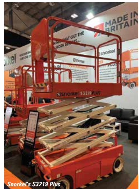
Snorkel's S3219 Plus