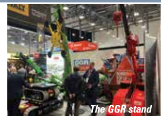
The GGR stand