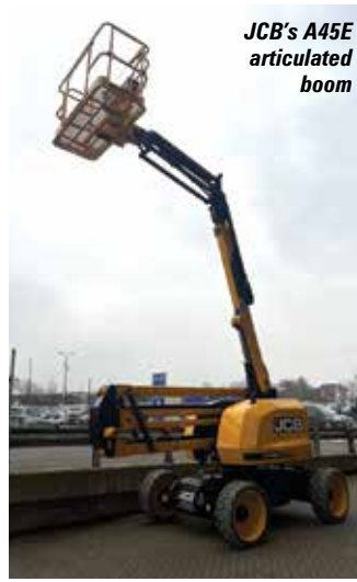
JCB's A45E articulated boom