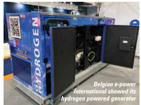
Belgian e-power International showed its hydrogen powered generator