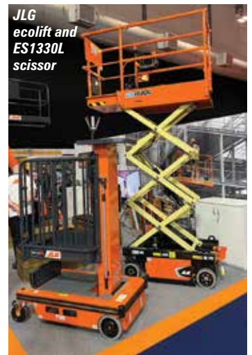
JLG ecolift and ES1330L scissor