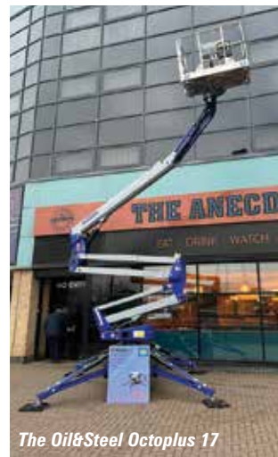
The Oil&Steel Octoplus 17