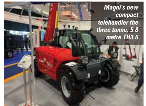
Magni's new compact telehandler the three tonne, 5.8 metre TH3.6