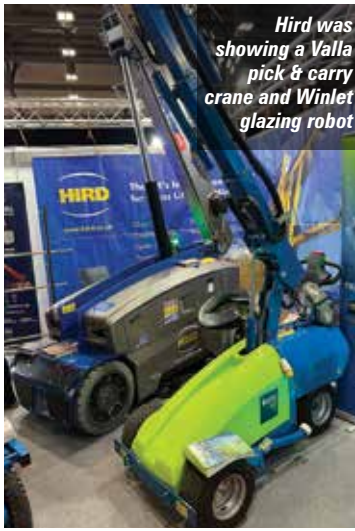
Hird was showing a Valla pick & carry crane and Winlet glazing robot