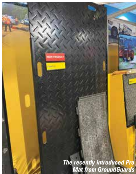
The recently introduced Pro Mat from GroundGuards

Next year's event is scheduled for the 11th and 12th February.