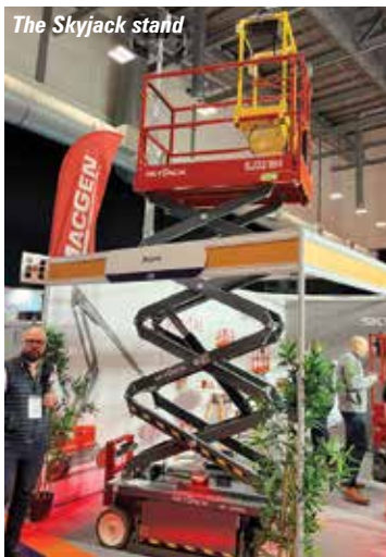
The Skyjack stand