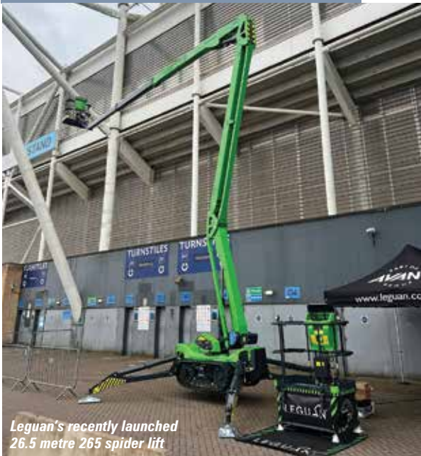
Leguan's recently launched 26.5 metre 265 spider lift