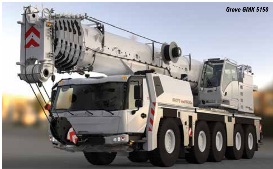
Grove GMK 5150

Manitowoc will highlight after sales services but has the new Potain 309 on the stand along with a working version of its hybrid system for All Terrains on the 150 tonne GMK 5150 which charges when on the road in between jobs. Also look out for a new charging system for its small Potain self-erectors.