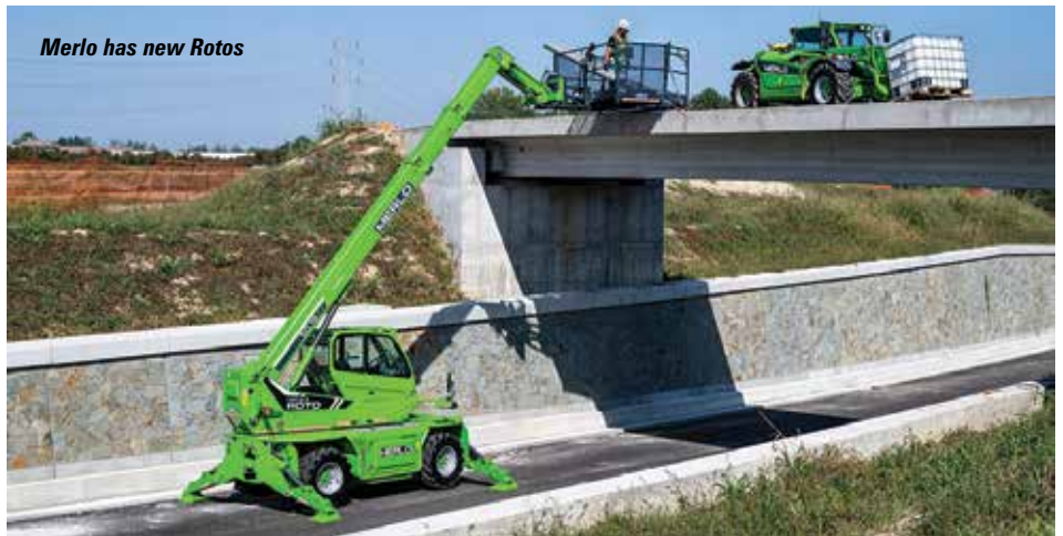
Merlo has new Rotos

units will be European built from non-Chinese fabrications and components. Noblilift recently announced that it was going to get serious about the aerial lift market, so you can expect a big effort so it will be worth checking out.