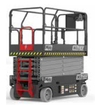
Mote Lift has a range of three electric scissor lifts with working heights from 10 to 14 metres

Based in the Turkish province of Eskişehir in Central Anatolia, the group has 700 employees and three production facilities with a combined surface area of 148,000 square metres.