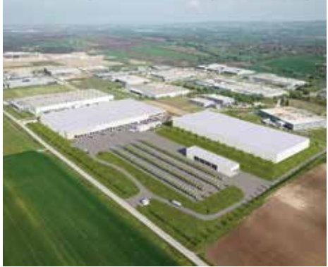
The facility is on an industrial park in Tatabánya

Ren Huili of Zoomlion Access said: "This move reflects Zoomlion Access' commitment to localisation efforts. We aim to serve our customers better with locally manufactured products, while contributing to the growth of the Hungarian industrial landscape."