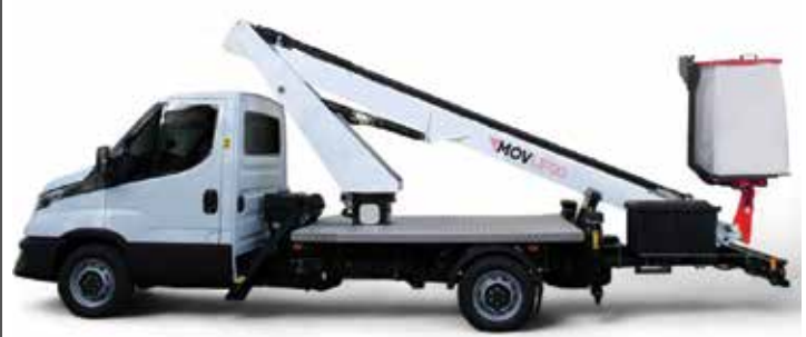
The new France Elévateur Mov-Up 20