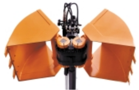
Kinshofer UK will be launching its new HPX Drive clamshell bucket design at this year's show

Since the merger of the UK's three biggest road transport shows back in 2000, The Commercial Vehicle (CV) Show has earned itself the title of Europe's second largest road transport exhibition. C&A looks ahead to the 2003 event.