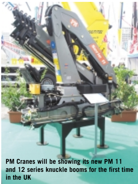
PM Cranes will be showing its new PM 11 and 12 series knuckle booms for the first time in the UK

The CV show has grown significantly since its initiation in 1994, where 78 exhibitors attracted just over 2000 visitors, compared with a reported 22,700 visitors last year. Organised by The Society