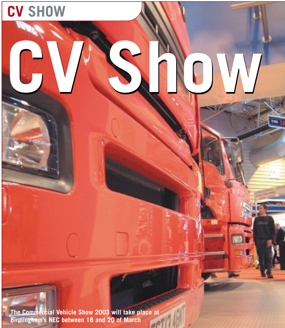
The Commercial Vehicle Show 2003 will take place at Birmingham's NEC between 18 and 20 of March

APPROXIMATELY 23,000 transport industry professionals are expected to drop in on an estimated 500 exhibitors in Halls 2 – 5 of Birmingham's NEC between 18 and 20 of March to see the latest trucks, vans, trailers, bodies, ancillary equipment, lifting and handling equipment, logistic management systems, finance and insurance services on offer from the transport sector.