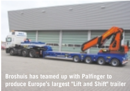
Broshuis has teamed up with Palfinger to produce Europe's largest "Lift and Shift" trailer

its 300, 500, 700 and 900 series, suitable for mounting on vehicles from 3.5 tonnes to 34 tonnes and above. Many models are now available as "SC" (short boom) versions for use with heavy and bulky weights and for maximising deck space on vehicle bodies without sacrificing outreach.