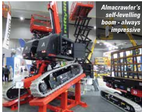
Almacrawler's self-levelling boom - always impressive