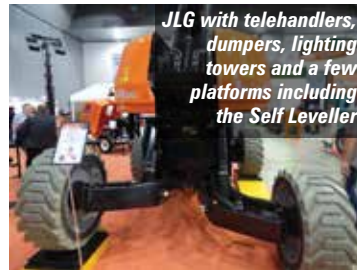
JLG with telehandlers, dumpers, lighting towers and a few platforms including the Self Leveller