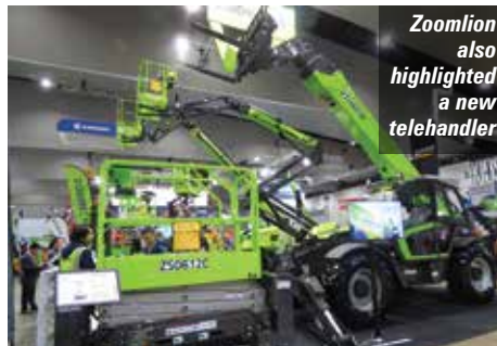
Zoomlion also highlighted a new telehandler