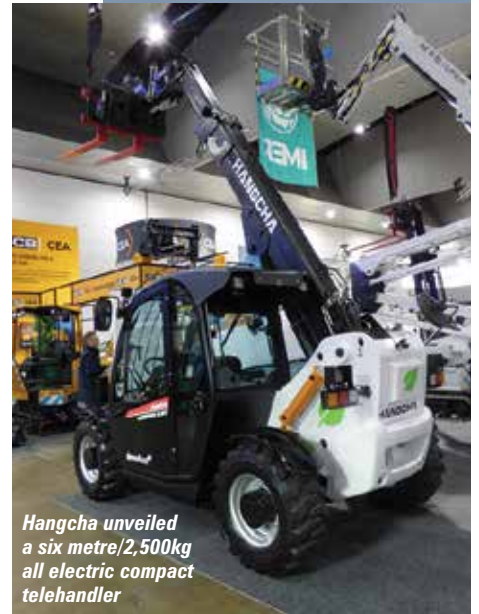
Hangcha unveiled a six metre/2,500kg all electric compact telehandler