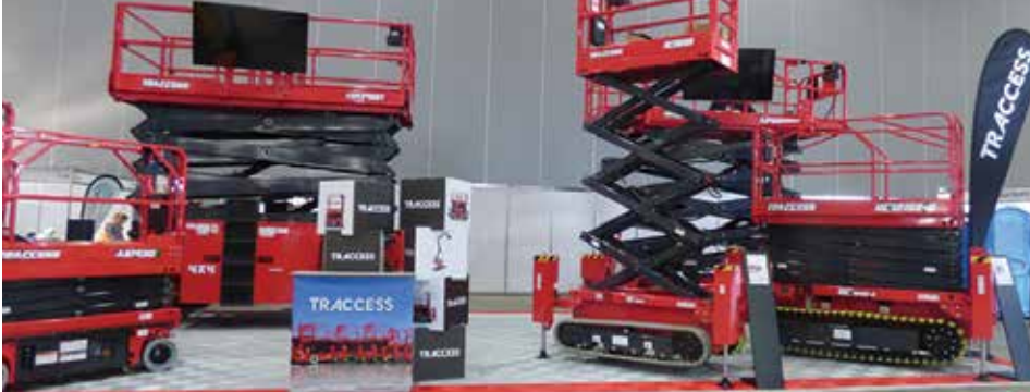
Tracess scissors made by Hered