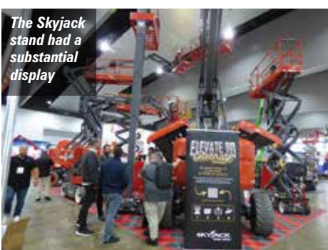
The Skyjack stand had a substantial display