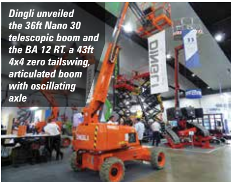
Dingli unveiled the 36ft Nano 30 telescopic boom and the BA 12 RT, a 43ft 4x4 zero tailswing, articulated boom with oscillating axle