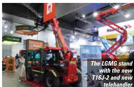
The LGMG stand with the new T16J-2 and new telehandler