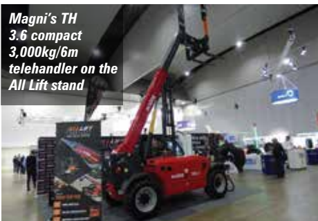
Magni's TH 3.6 compact 3,000kg/6m telehandler on the All Lift stand