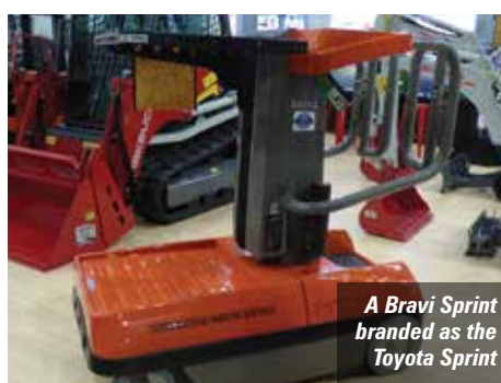
A Bravi Sprint branded as the Toyota Sprint