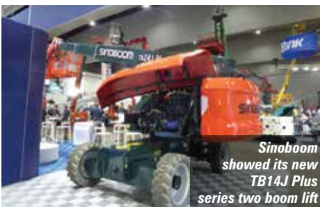
Sinoboom showed its new TB14J Plus series two boom lift