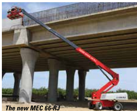
The new MEC 66-RJ

Features include four wheel multi-mode steering and four wheel drive with oscillating and locking differentials. Options include a glazing package, an onboard generator driven welder, Xtra-Deck which provides an additional 500mm of platform height, and its PPSS ultrasonic anti-entrapment system.