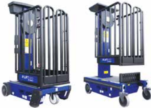
The Tubasca R'Lift 350 and 420