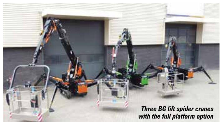
Three BG lift spider cranes with the full platform option

BG Lift after sales manager Michele Piantoni said: "We are the first in the sector to offer this possibility. While some manufacturers do not offer an integrated platform or even allow the use of a work platform on their cranes, we have been offering a platform option for years and have taken the extra step to help add value for our customers."