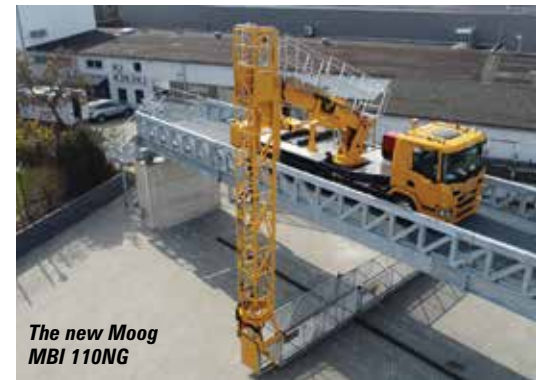
The new Moog MBI 110NG

The MBI 110-1.2 NG has an overall weight of between 14.5 and 18 tonnes depending on the chassis. The drive unit for creep mode is now integrated directly into the solid rubber support wheels for maximum power transmission. An inclination compensation system allows the machine to operate on slopes of up to 3.5 degrees longitudinally or 6.8 degrees laterally.