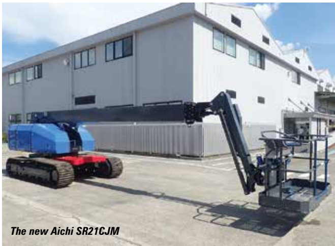
The new Aichi SR21CJM