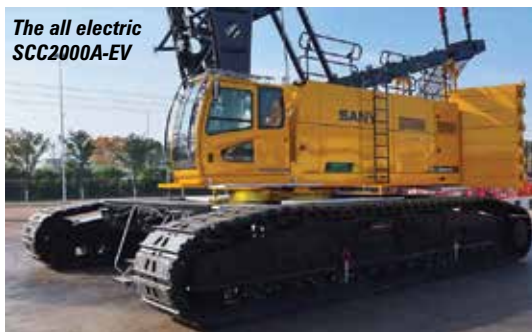
The all electric SCC2000A-EV

The crane uses a 423kWh battery said to provide eight hours continuous operation, standard European DC fast chargers taking less than two hours for a full recharge, while standard AC charging is also possible.