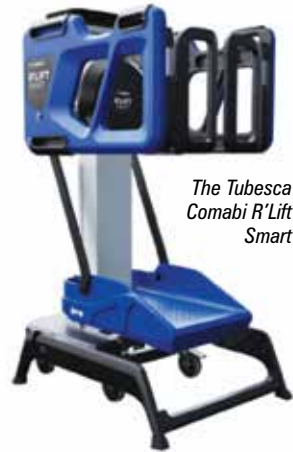
The Tubasca Comabi R'Lift Smart

JLG has also launched an improved Nano 35 push around lift for North America where it will be known as the 1230P, while announcing a number of upgrades to its 830P and 1030P low level lifts and non-powered EcoLift 50 and 70. The key specifications of the 1230P remain the same with a 5.3 metre working height, and 200kg platform capacity. The improvements to the smaller lifts include a punched platform surface, upgraded vertical guardrails, improved castors with easier locking/unlocking, automatic brakes and easier platform entry.