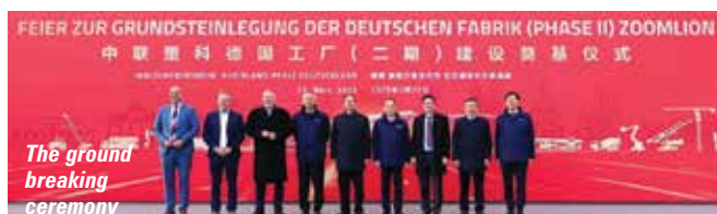
The ground breaking ceremony