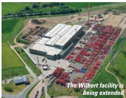
The Wilbert facility is being extended

Zoomlion is also developing a new 55,000 square metre powered access facility in CTPark, Tatabánya, Hungary, north west of Budapest towards Bratislava, Slovakia. See C&A 27.1- Feb/March.