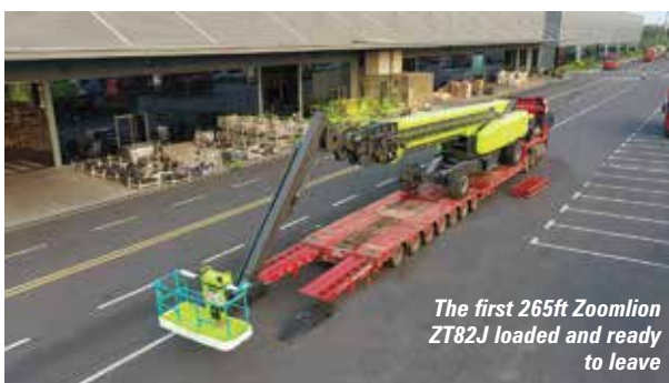
The first 265ft Zoomlion ZT82J loaded and ready to leave

This is the second record breaker in as many months for Hire Safe Solutions. Last month it took delivery of the first 232ft Zoomlion ZT72J with a working height of 72.3 metres and a maximum platform capacity of 454kg, both part of a 114 unit/€20 million investment by the company in new Zoomlion platforms this year.