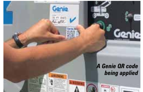
A Genie QR code being applied

The company says future developments will include product walk around videos, operator and technician training videos, and customer integration into the digital platform. QR codes are being introduced for North American customers and will be included on all new machines globally by the end of the year.