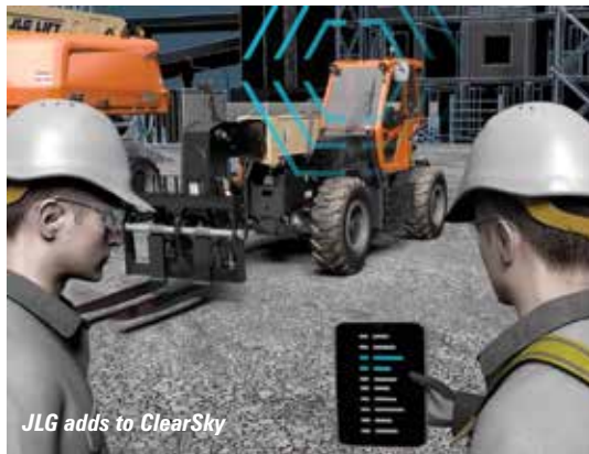
JLG adds to ClearSky

The new software can be downloaded remotely via a web portal or mobile app and applied wirelessly to multiple machines at once, with onsite personnel only needed to trigger the update.