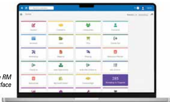
The RM Web interface