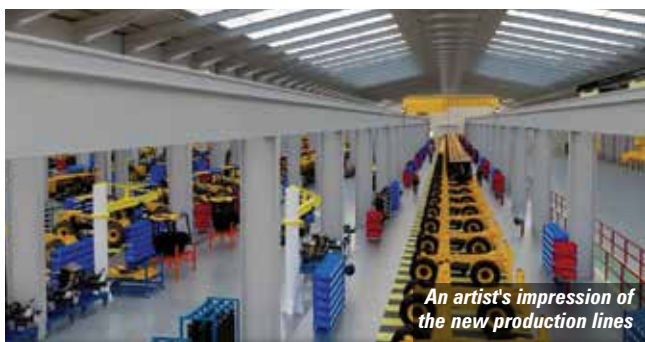
An artist's impression of the new production lines

The project includes £60 million for a new fully automated powder paint plant, along with the modernisation of the telehandler and loader backhoe assembly lines. Other upgrades include new machining centres, friction welders and cylinder boring machines.