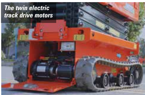
The twin electric track drive motors

Features include a 600mm roll-out deck and, when stowed, has an overall length of 1.45 metres, an overall width of 790mm and is two metres high. Its overall weight is 820kg. The lift uses electric actuators in place of hydraulic cylinders for lift and steer, and direct drive AC motors to power the tracks. It therefore requires no pump, no oil tank and no hoses.