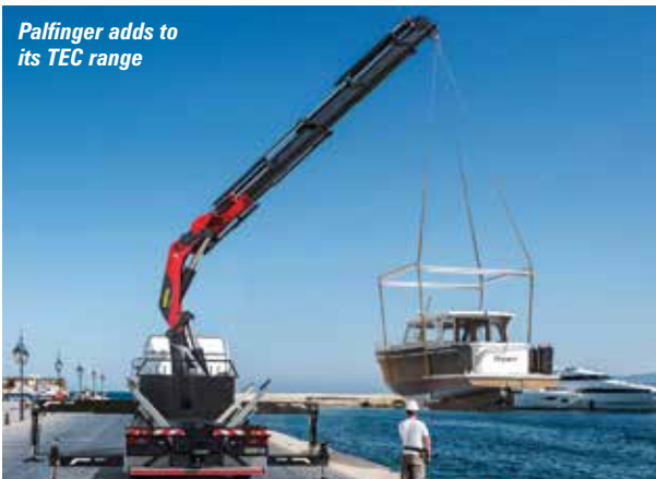
Palfinger adds to its TEC range

Standard features include the Paltronic 180 electronics and LX-6 control valve for a smoother, more responsive operation. The HPSC-Plus stability monitoring system checks the outrigger setup and jack loadings, and the 'Bound' virtual wall automatically limits the work once set for the work area. The PK 720 TEC is now available to order for deliveries in Europe, Africa and the Middle East.