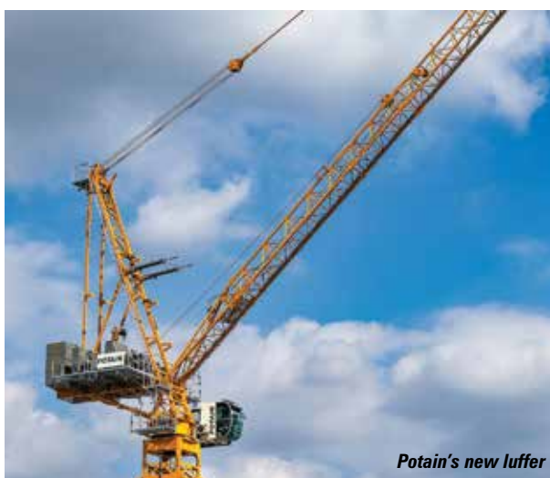
Potain's new luffer

The crane supports both 50Hz and 60Hz power supplies and includes adaptive power control to reduce energy consumption.