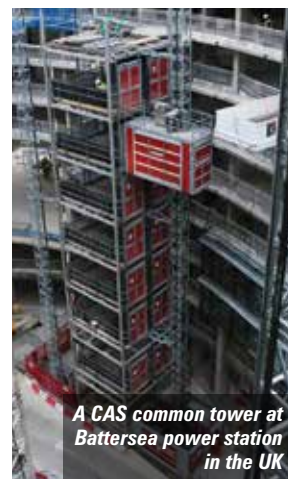
A CAS common tower at Battersea power station in the UK