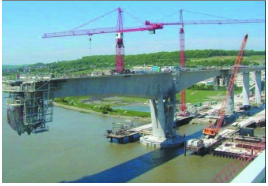
Kier Plant and Arcomet designed and fabricated special steel bases for two rail-mounted tower cranes on the permanent deck of the Channel Tunnel Rail project at the Medway Crossing in Rochester. A further two towers have been erected on temporary 80 metre long jetties.

A recent addition to Kier Plant's tower crane fleet is the UK's first ever Liebherr 160HC-L luffing jib tower crane, which will be erected in the King's Cross area of London later this year. The crane offers a maximum capacity of 8 tonnes at 25.4