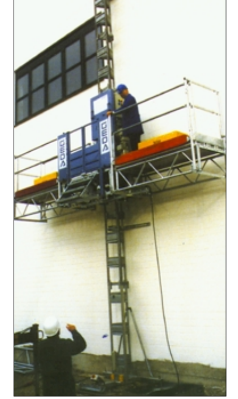
The Geda MCP 750

jected £10 million per annum by 2003. During this time, the company has also secured the BS EN ISO 9000 Quality Registration and dual Accreditation of Investor in People status for its workforce development. The company is constantly pushing for the recognition of the benefits of MCWPs instead of scaffolding from councils and contractors.