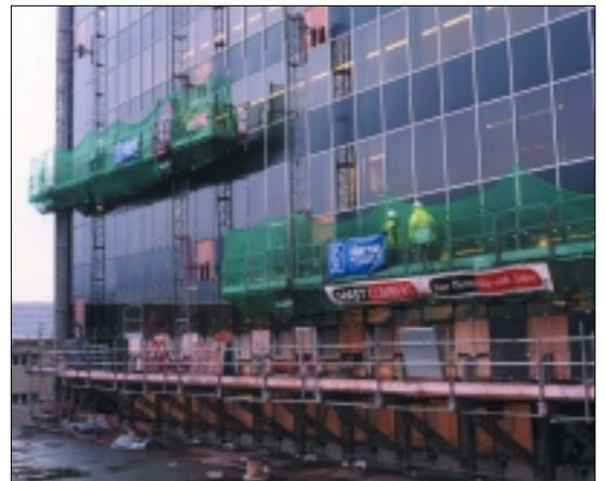
Mastclimbers' shelf bracket system

(the US Occupational Safety and Health Administration) statistics indicate that the number of (scaffolding related) injuries is declining. This may be more the result of innovations and new equipment rather than an increase in safety awareness with scaffolding."