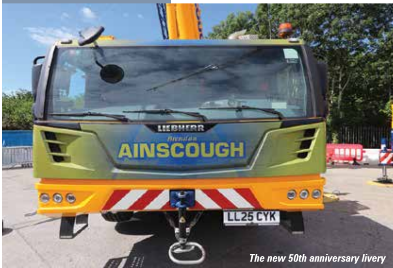
The new 50th anniversary livery