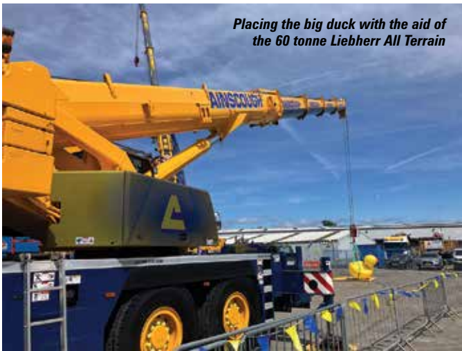
Placing the big duck with the aid of the 60 tonne Liebherr All Terrain