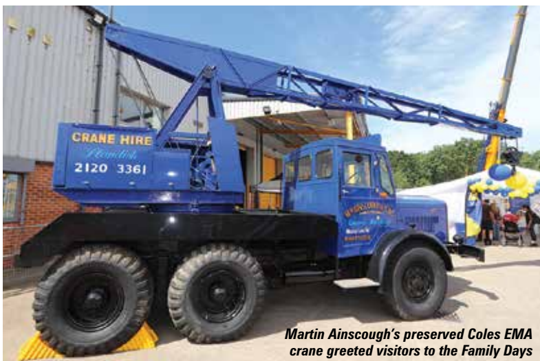
Martin Ainscough's preserved Coles EMA crane greeted visitors to the Family Days

Much to his obvious delight, Ernie was also allowed to drive - again under close supervision - a 6x4 Scania 660S XT tractor unit, coupled to a six axle Nootboom ballast trailer. Other highlights included going up in the elevating cab of a 50 tonne LTM1050-3.1 Hybrid city type All Terrain and for the teenagers and adults, a ride in the