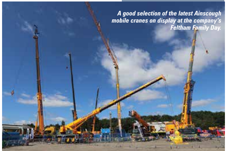
A good selection of the latest Ainscough mobile cranes on display at the company's Feltham Family Day.