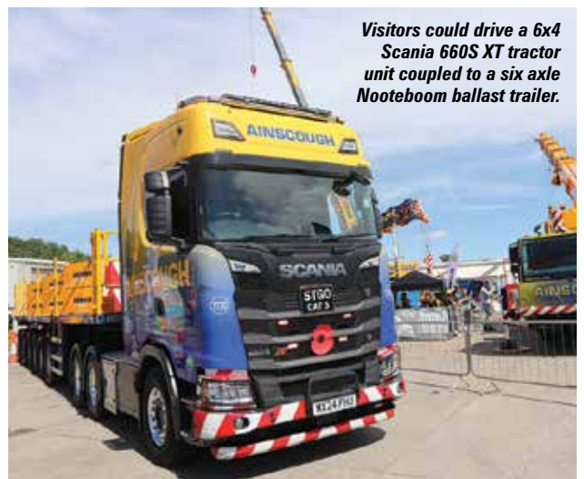
Visitors could drive a 6x4 Scania 660S XT tractor unit coupled to a six axle Nootboom ballast trailer.