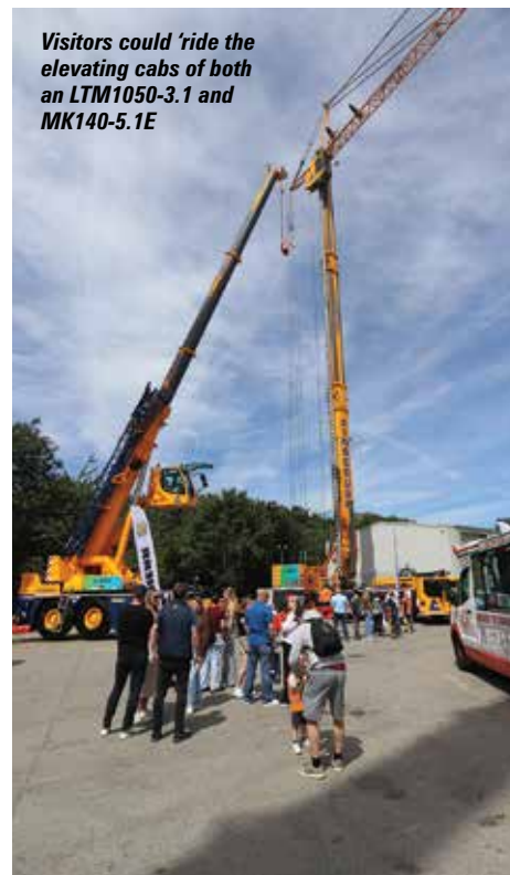
Visitors could 'ride the elevating cabs of both an LTM1050-3.1 and MK140-5.1E