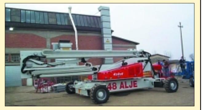
The newly launched Basket Sel 48 ALJE-D, with a 48 metre working height and 23 metre outreach.