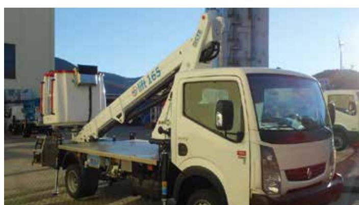
The B-Lift 165 is the first model in a new range of platforms up to 27m working height. Mounted on a Nissan Cabstar NT 400, the total weight of the 165 is less than 3,200kg, with an overall height of under three metres

ground by outriggers and wheels. It also recommends continual monitoring of outriggers during operation, so that the unit can be stopped if the outrigger or pads show any signs of sinking. The full WorkCover bulletin can be found at www.worksafe.qld.gov.au/news/safety-alerts/whsq/2015/support-ofmobile-plant-on-outriggers