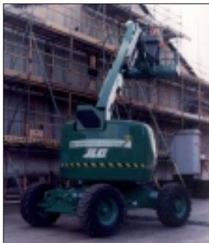
A-Plant is presenting a range of hire services targeted at the railway industry in the UK and Ireland during the forthcoming Infrarail 2000. The show takes place at the Wembley Exhibition Hall from 18th - 20th September.

Results for the six months ending 30 June 2001 were due to be announced on September 5, but the company predicted that second quarter revenue growth would be around 33 per cent as