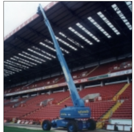
Nationwide's new S-125 boom is pictured working at a Premier League football ground.