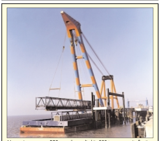
Norwegian company DDB recently supplied its 900 tonne capacity floating crane Samson to lift this 250 tonne steel linkspan bridge into position at the Port of Hull. The load is one of two passenger and vehicle linkspans which will connect the terminal building to the new P&O super-cruise ferries which come into service later this month. The bridge is part of a major £10 million upgrade undertaken by Kier Northern for Associated British Ports. The project was completed in mid-April.

Panther has depots in Luton and Southampton.