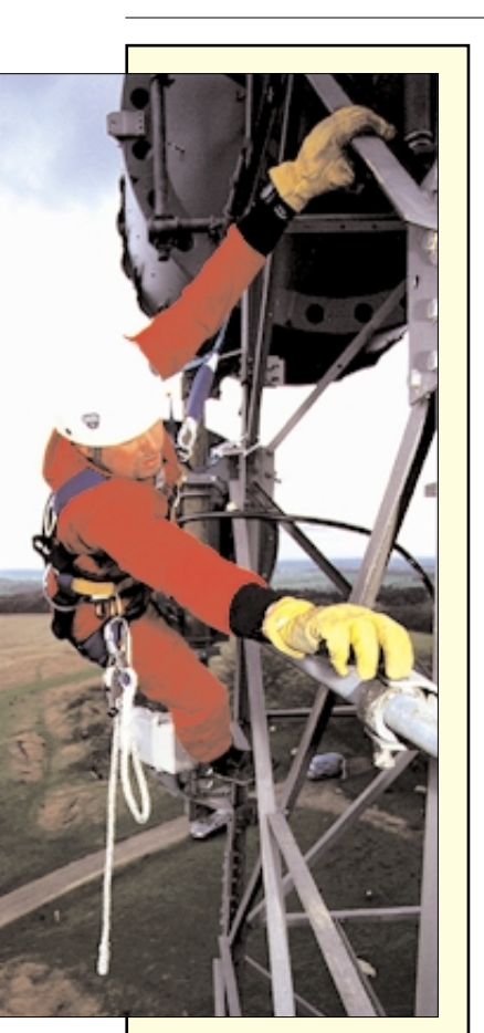
Tractel is unveiling a range of new height safety equipment at the forthcoming Safety & Health Expo 2001. These include Blocfor fall arrestors the Derope automatic descent rescue device, the Travsafe continuous horizontal lifeline system and a range of all-inclusive safety kits.

"Potain's access operations need to become a significant part of our turnover" said Bouffault adding that for him something around 25 per cent would be significant. Asked if there was any possibility that Manitowoc or Potain would consider selling Liftlux, Bouffault replied: "No, absolutely not".