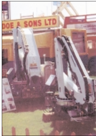
Cormach Cranes, a division of Ernest Doe, is on stand 314

diesel with 20.9 metres of working height and 10.7 metres of horizontal outreach. The AB38 is a compact electric articulating boom with 13.5 metres of working height, 5.4 metres up and over clearance, 6.1 metres horizontal outreach and an impressive 40 centimetre inside turning radius. Trailer mounts, micro scissors, Sigma lifts and a range of Access Tower systems make this an important stand to visit.