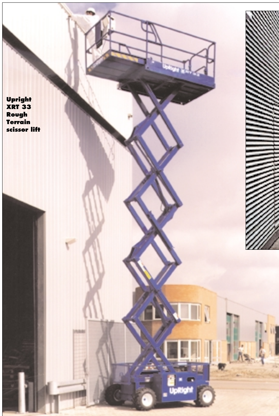
Upright XRT 33 Rough Terrain scissor lift

porters which have lifting capacities from 3 tonnes to 4 tonnes with reach varying from 7m to 16m across the 4 ranges. Alan Milne Tractors are currently looking for dealers throughout most areas of the UK and Ireland.