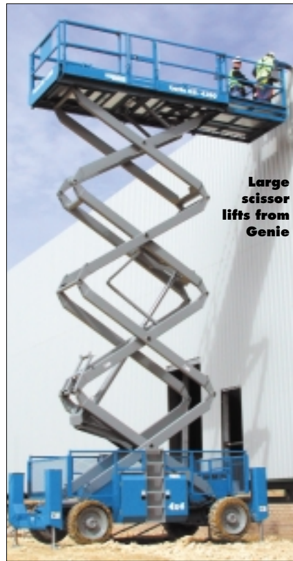
Large scissor lifts from Genie

Three new products will be on show from Versalift. The company has been in its new premises for a year now and is using SED to emphasise its strong presence in the UK and Irish truck mount markets. Its star product is the LT62NE. This is